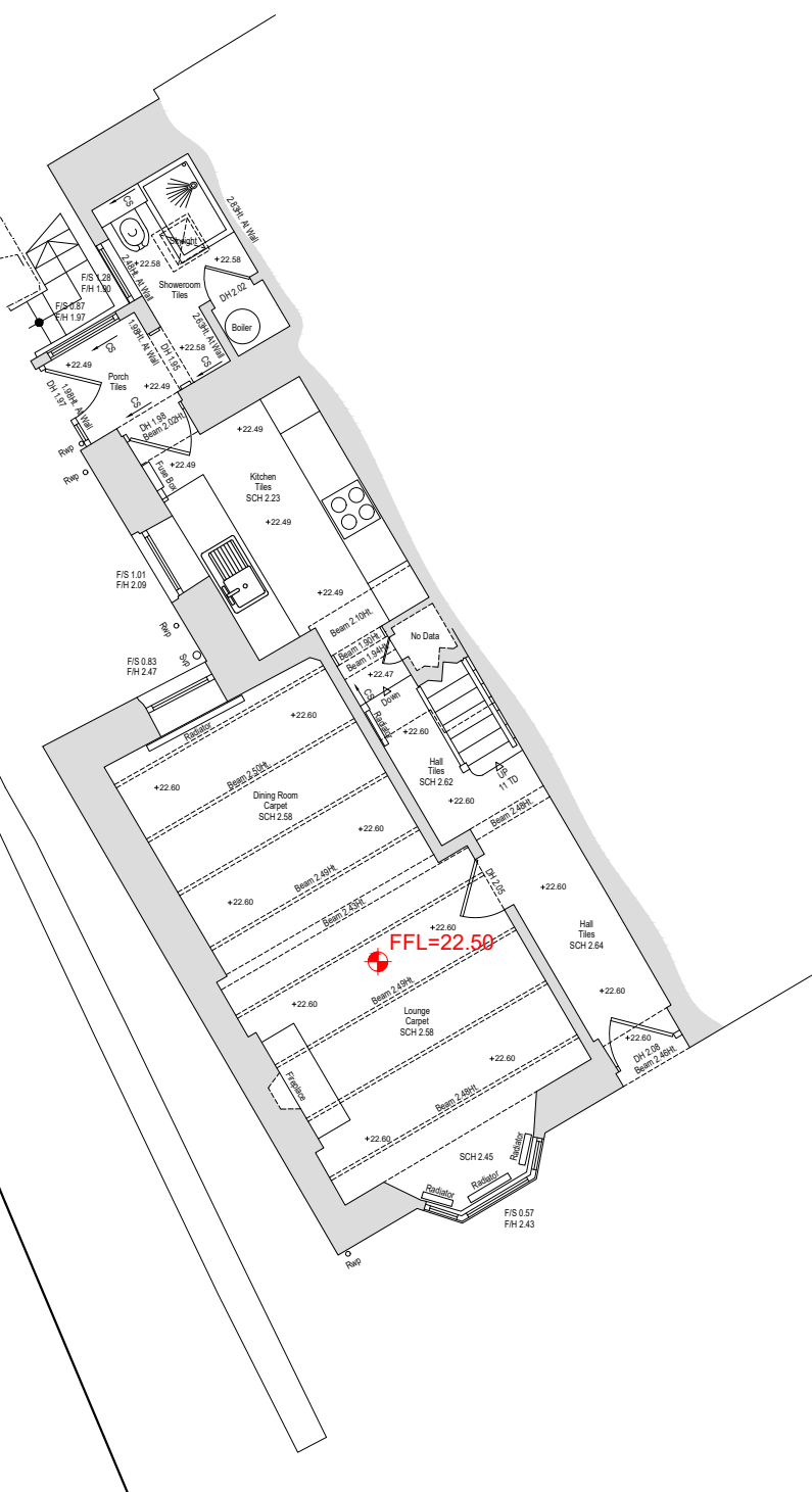
2 As Existing Ground Floor Plan SCALE 1:100