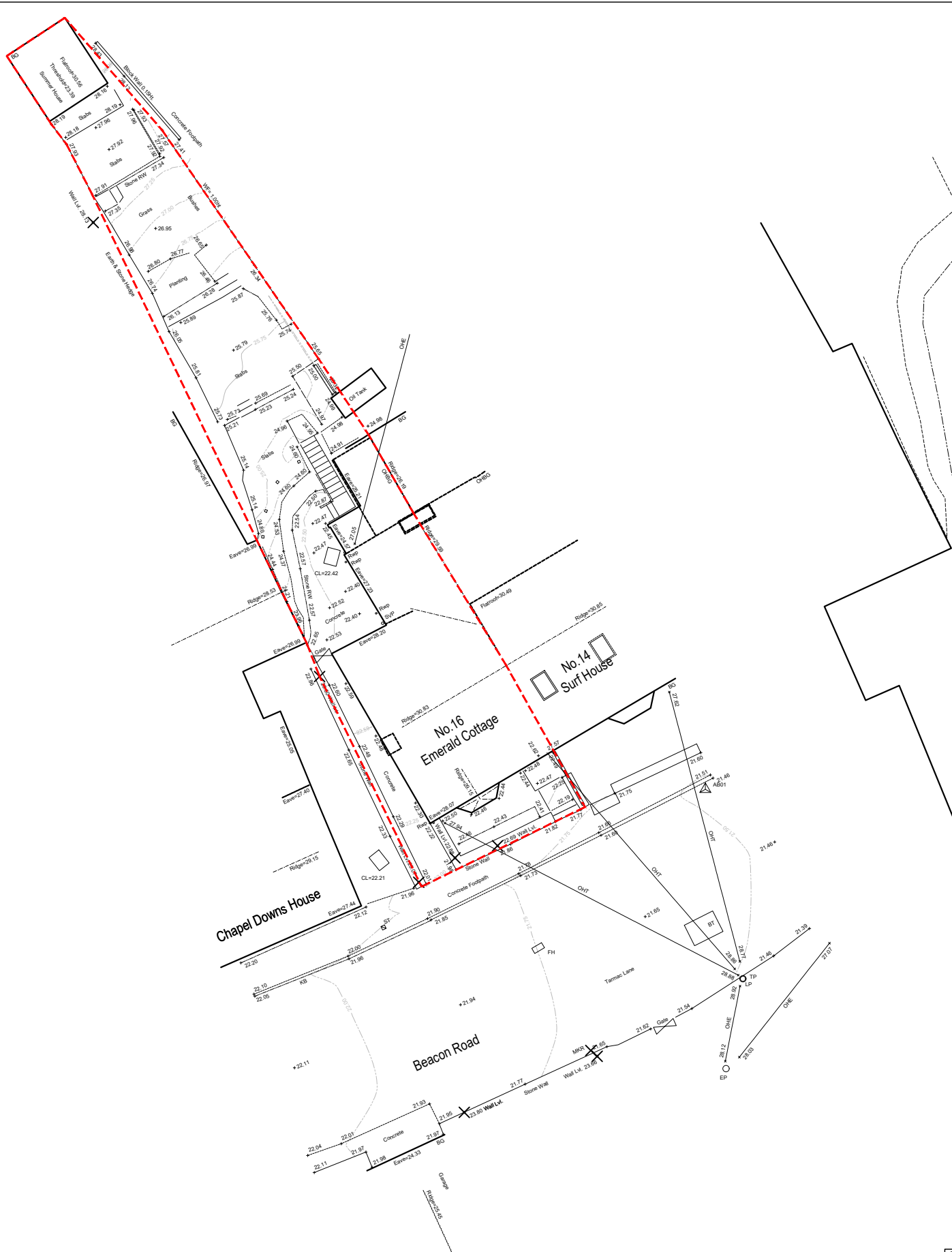
1 Site/Block Plan SCALE 1:200