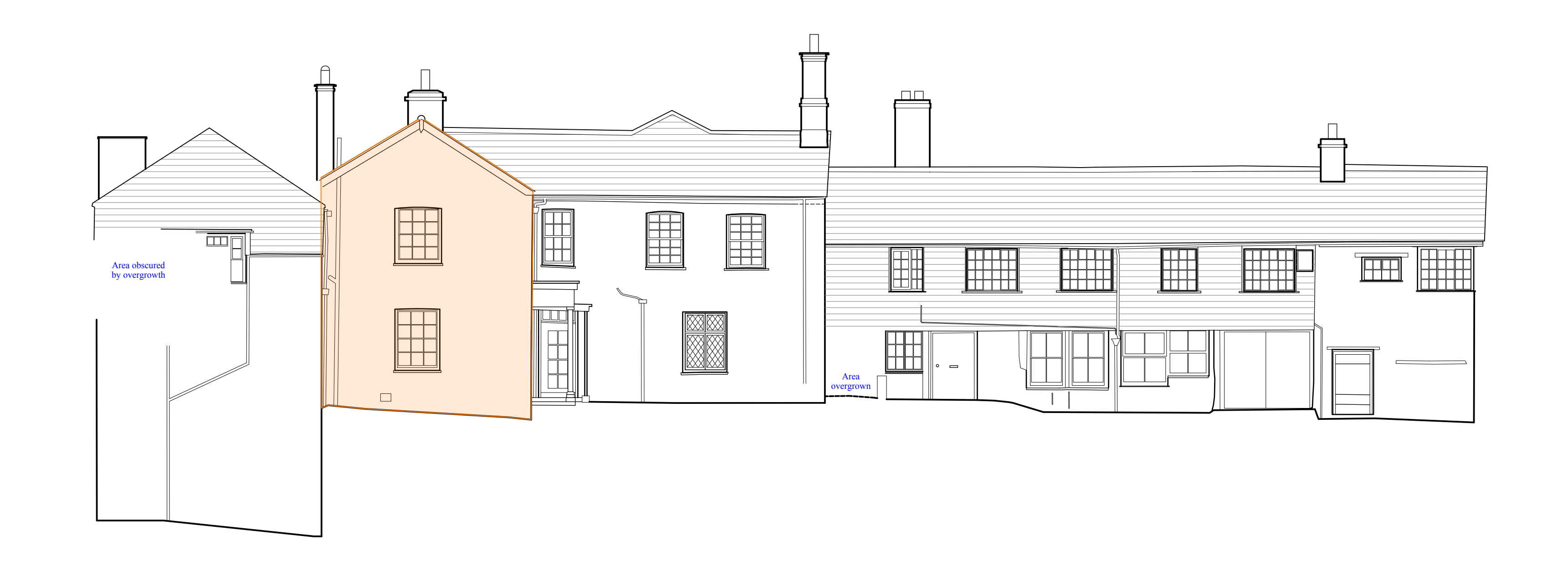
Proposed South Elevation