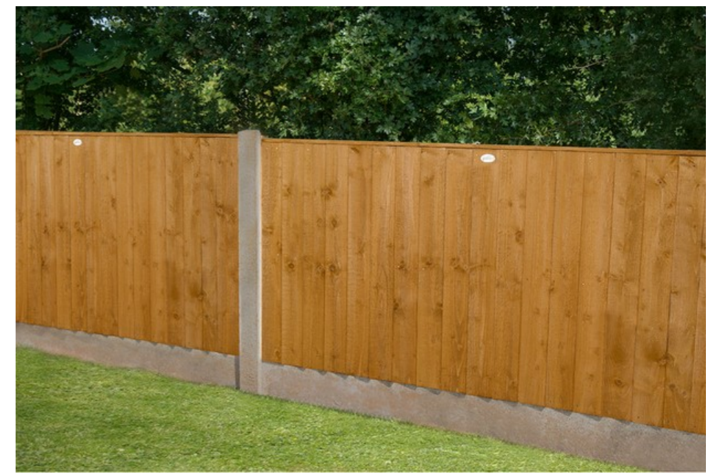
Detail of 1200mm fence