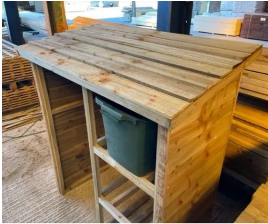
Simple bin/refuse store