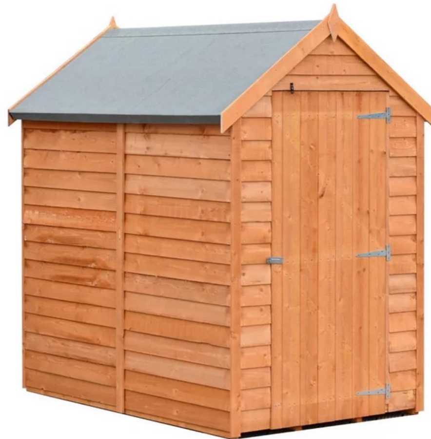
1800 x 1200mm Bike Store