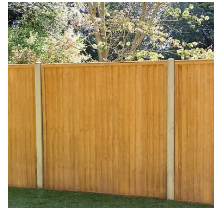
Detail of 1800mm fence