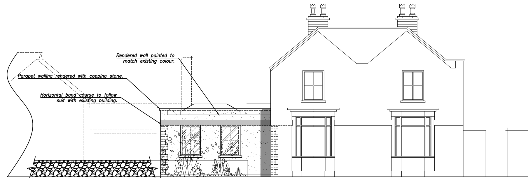
PROPOSED SOUTH ELEVATION - Facing Shepherds Way