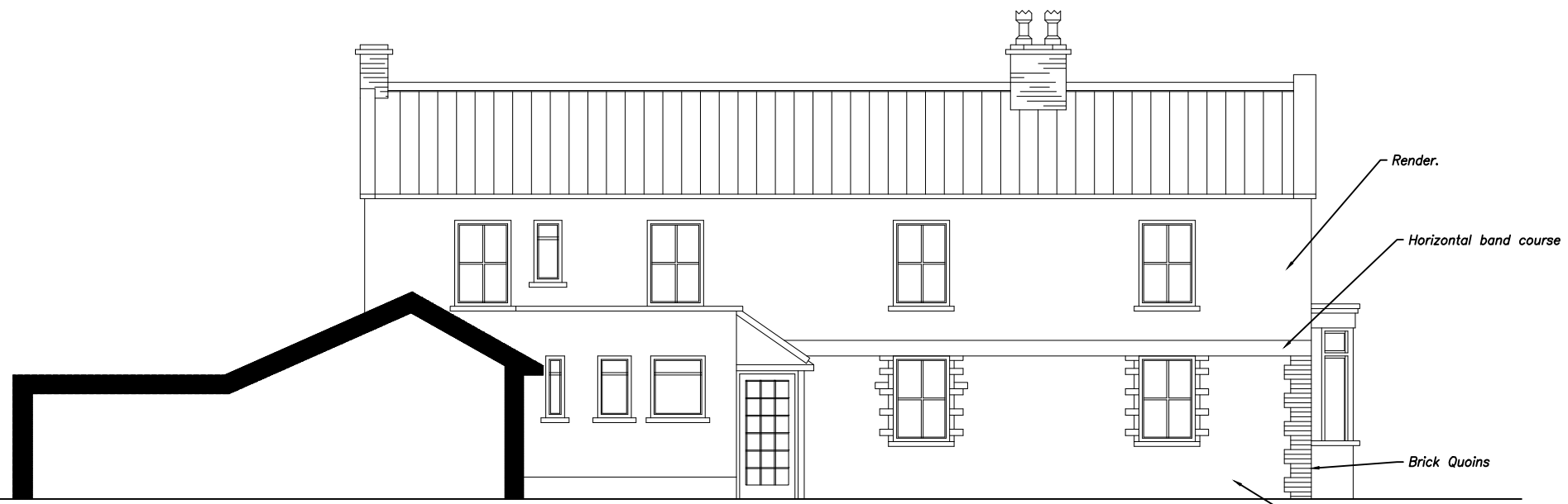
EXISTING WEST FACING ELEVATION - Facing Carpark