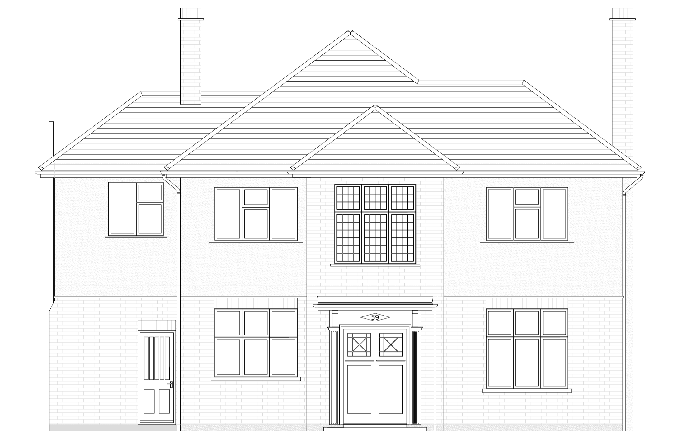
PROPOSED FRONT ELEVATION (GUIBAL ROAD) no changes SCALE: 1:50