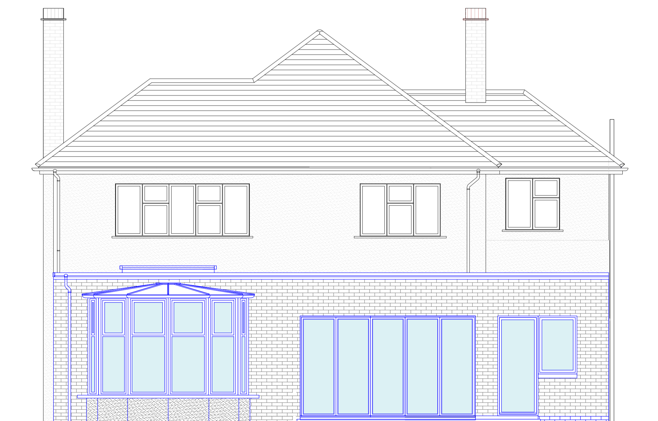
PROPOSED REAR GARDEN ELEVATION SCALE: 1:50