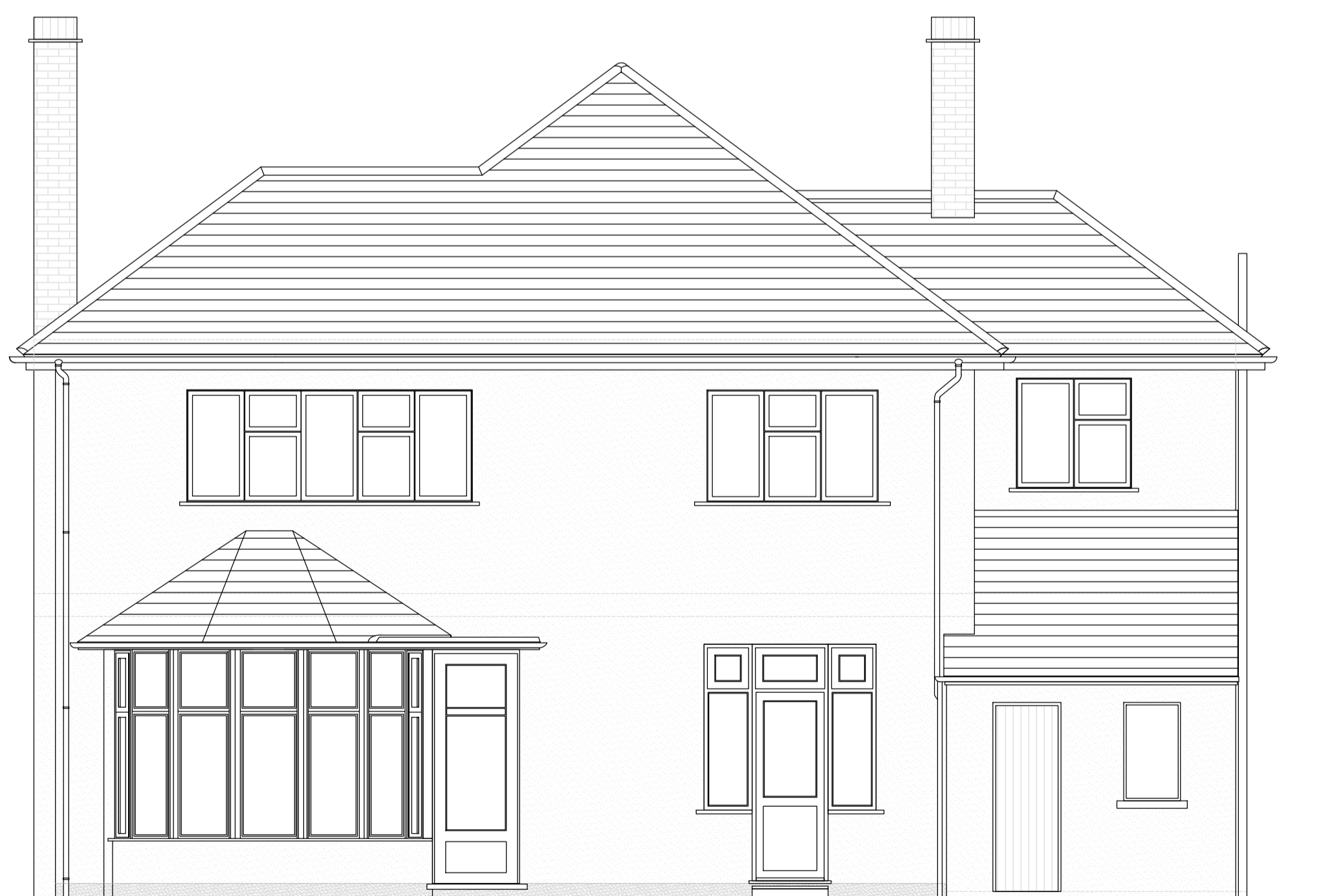
EXISTING REAR GARDEN ELEVATION SCALE: 1:50