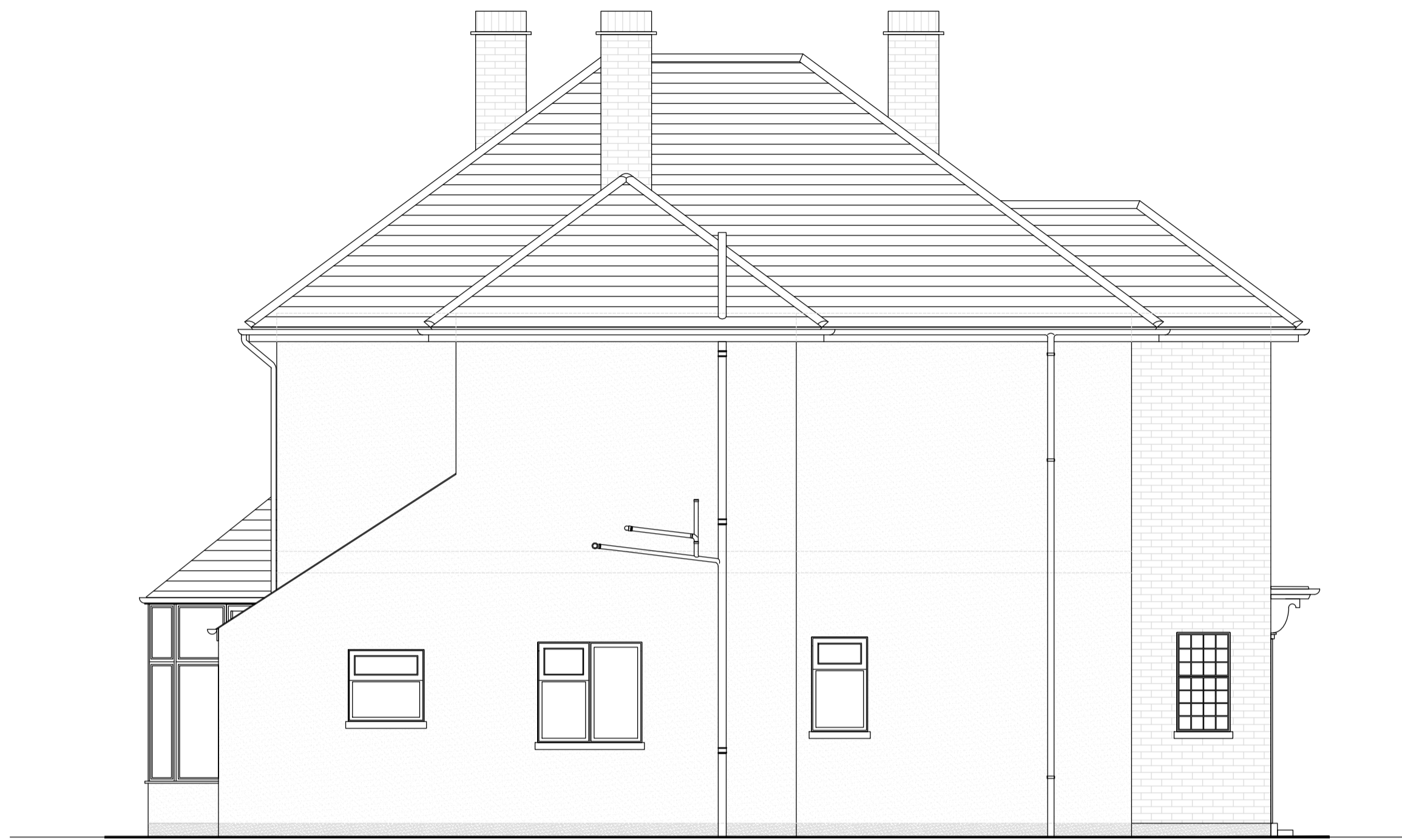
EXISTING SIDE ELEVATION (north) SCALE: 1:50

Notes - General: 1. Drawings produced are for planning application approval only and may not cover all elements required to ensure project completion 2. All dimensions to be checked on site by contractor 3. Do Not Scale From Drawing