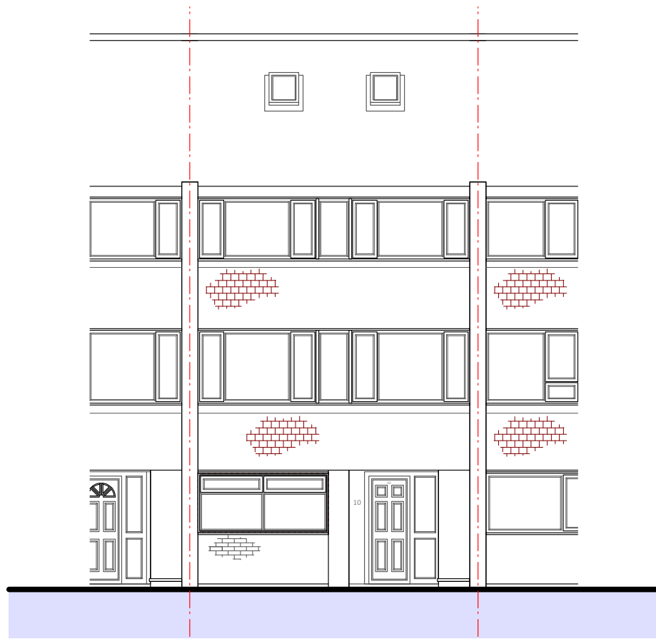
Existing FRONT ELEVATION - no changes proposed