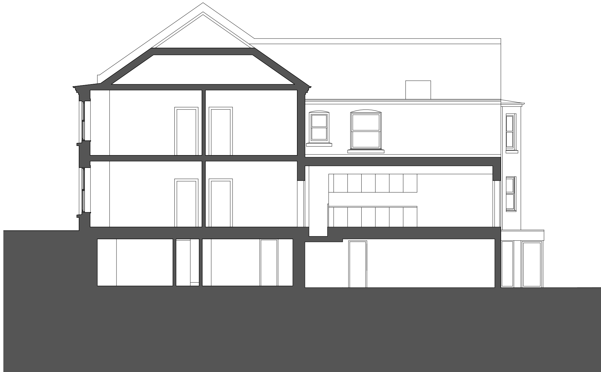
01 Proposed Section DD Scale: 1:100