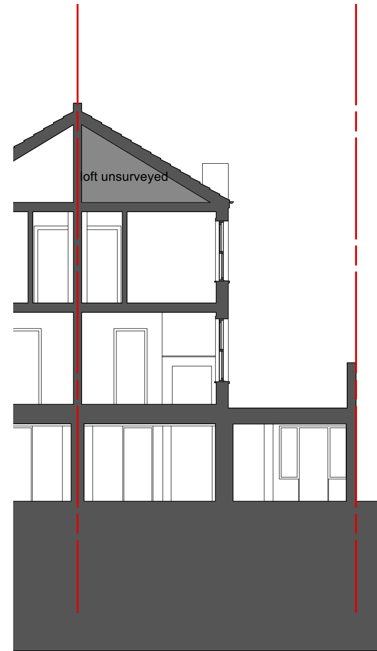
02 Existing Section BB Scale: 1:100

© All information contained within this document remains copyright of Architecture Landscape Urbanism Ltd and shall not be reproduced without prior consent.