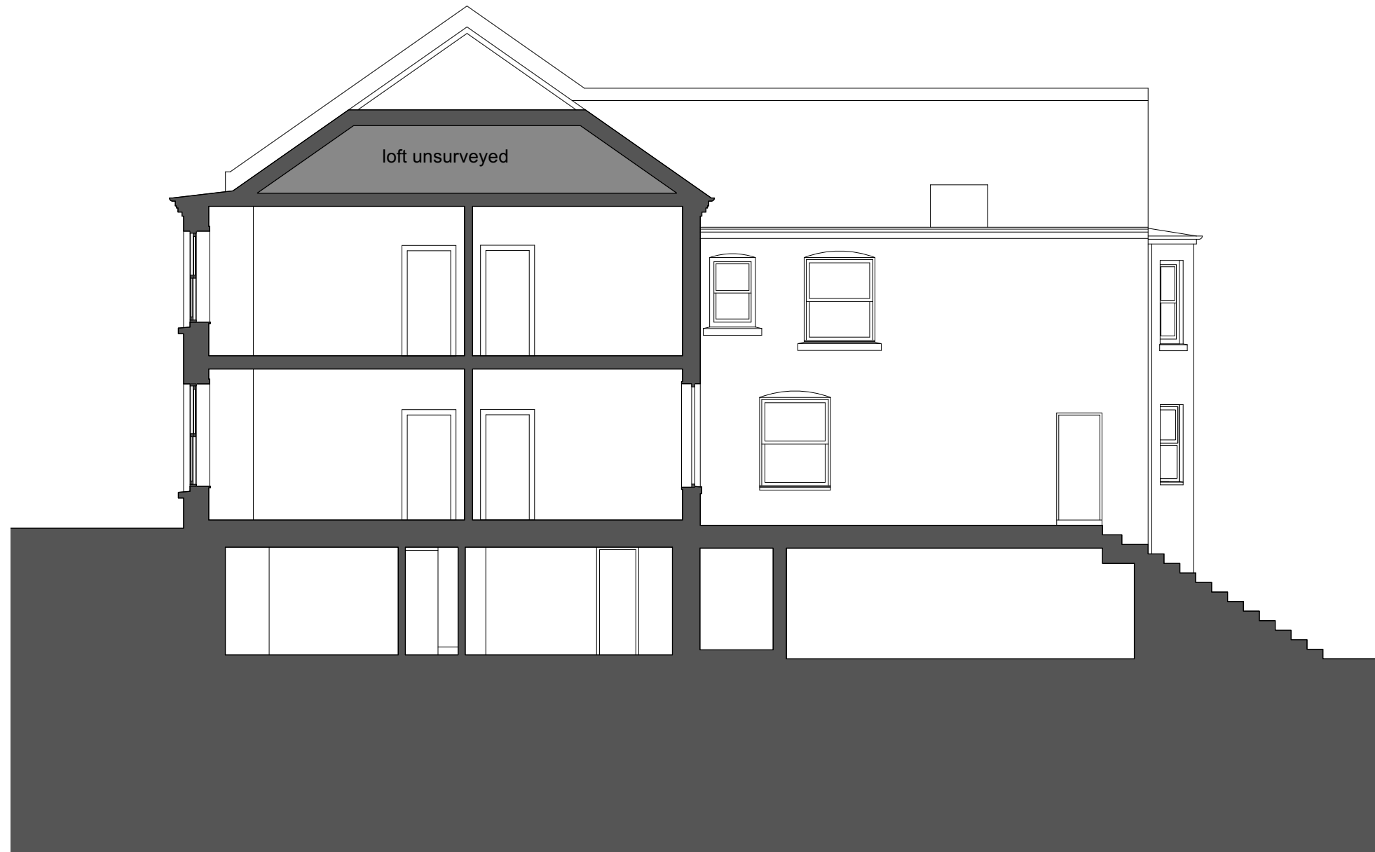
01 Existing Section DD Scale: 1:100