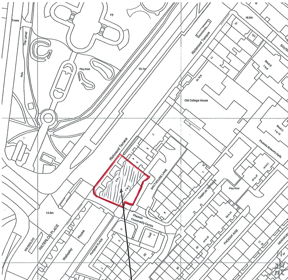
SITE LOCATION PLAN. (SCALE 1:1250).

1-3 RICHMOND TERRACE, BRIGHTON, EAST SUSSEX, BA2 9SA.