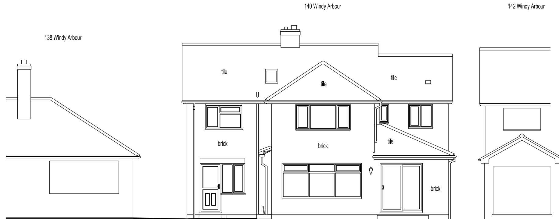
REAR ELEVATION Northeast