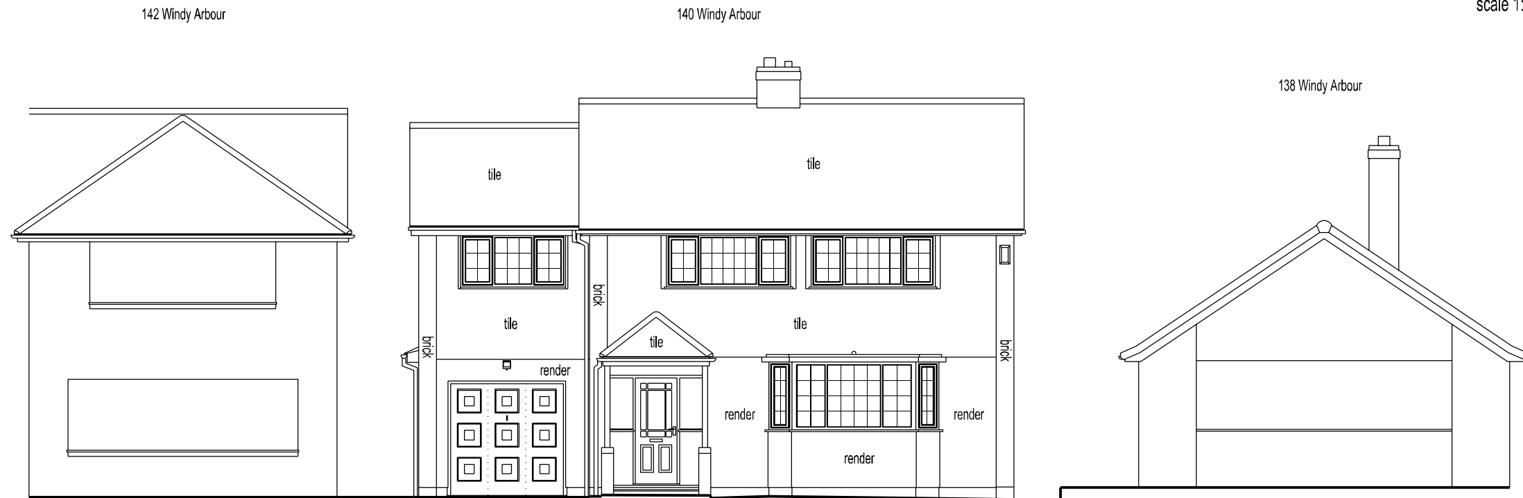
FRONT ELEVATION Southwest