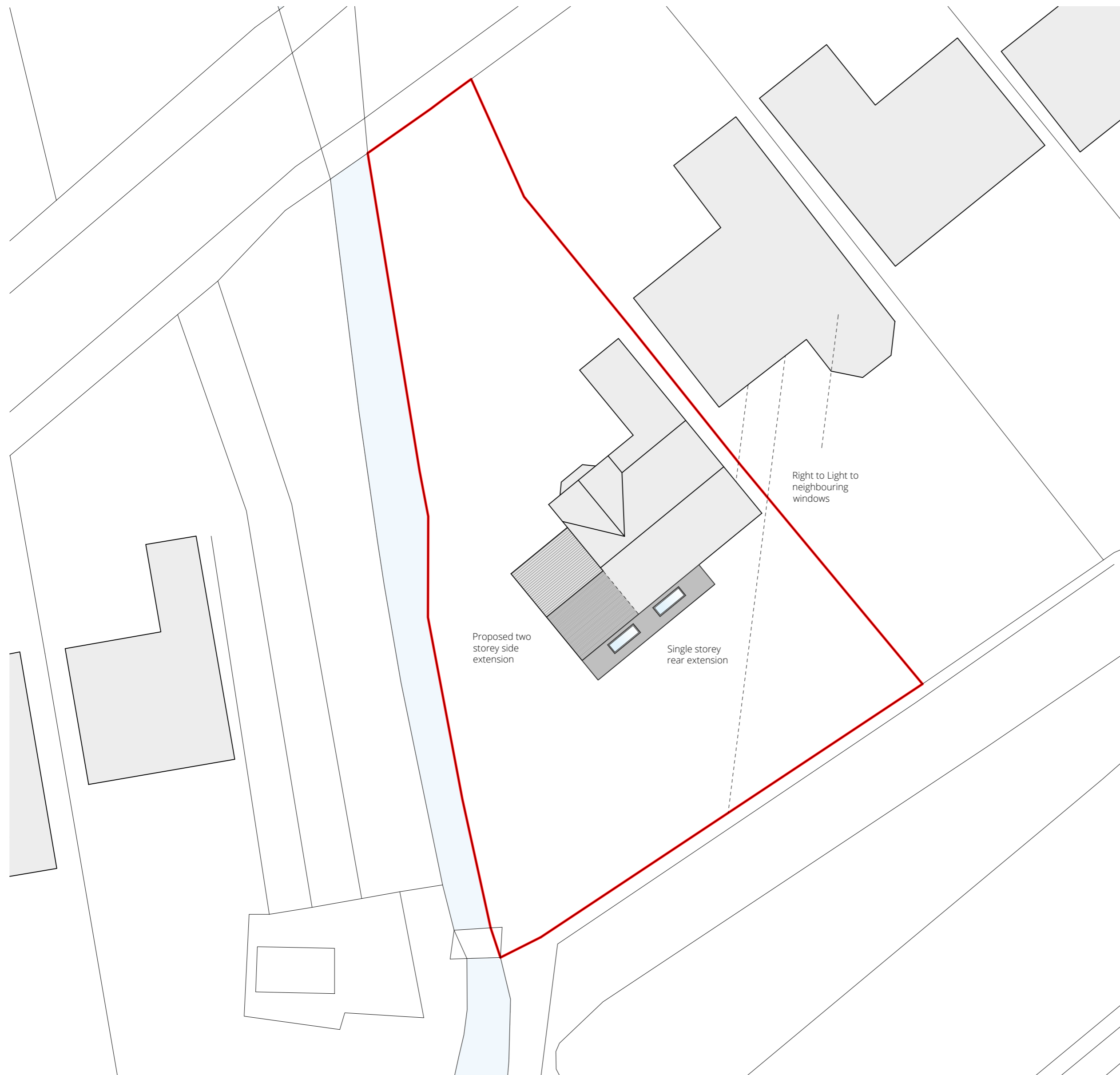
BLOCK PLAN AS PROPOSED | Scale 1:200