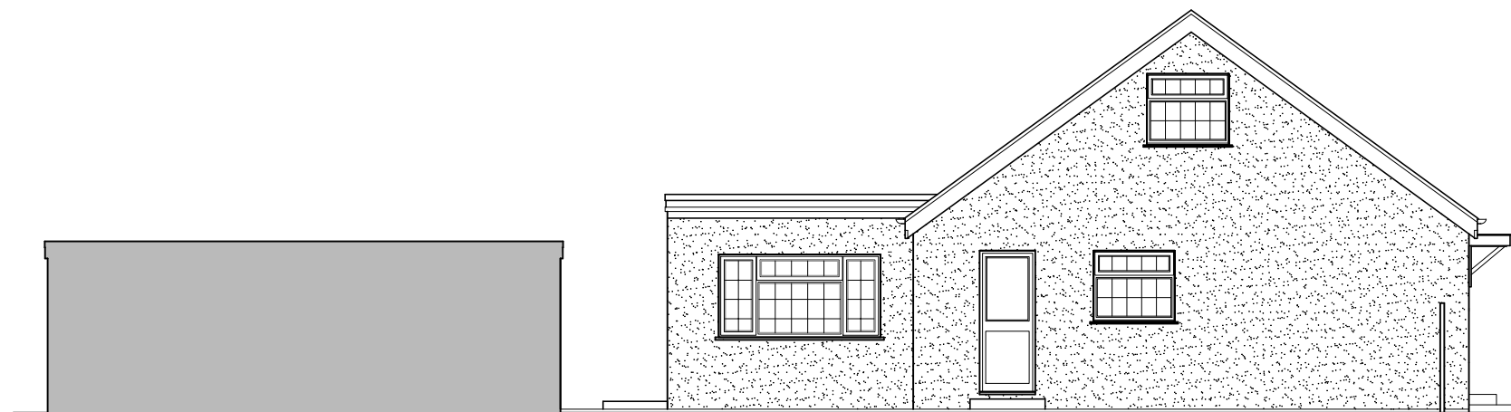
East (side) elevation