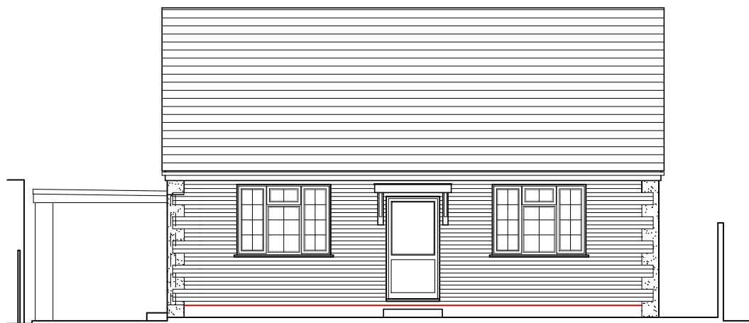
North (front) elevation