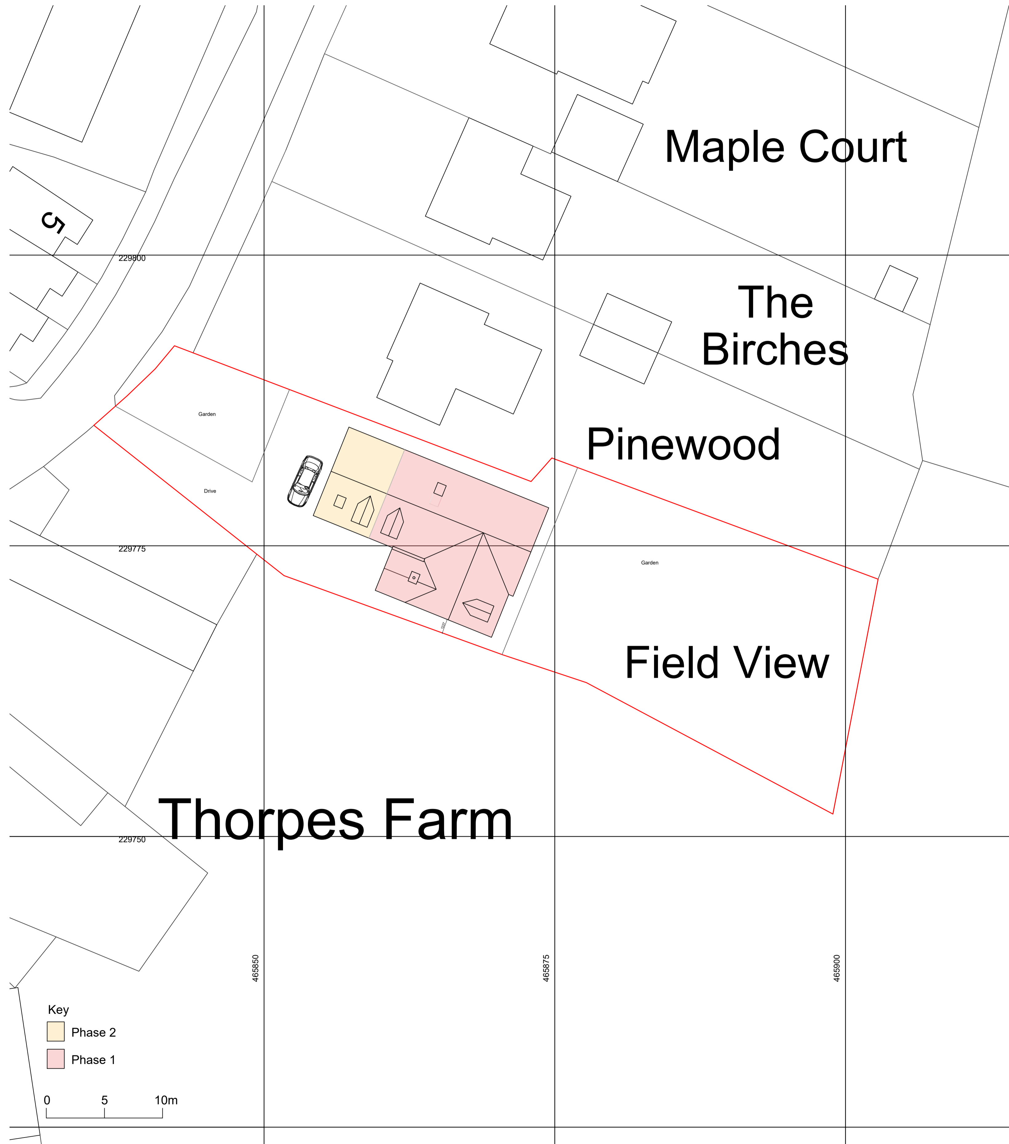
Site Plan 1 : 200