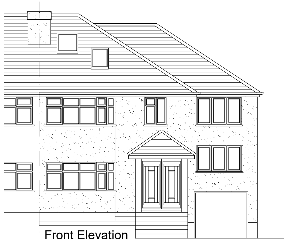
Front Elevation as Existing