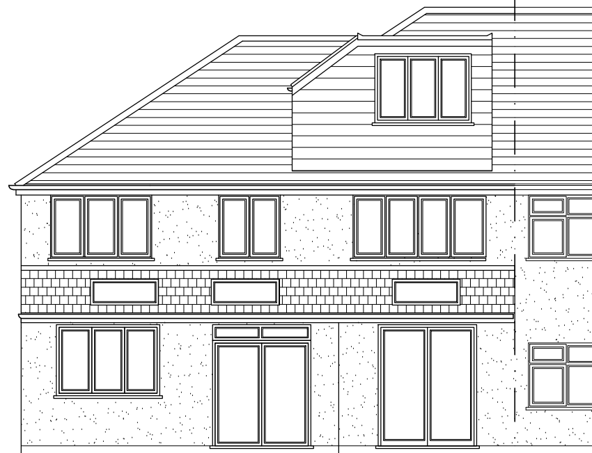
Rear Elevation as Existing