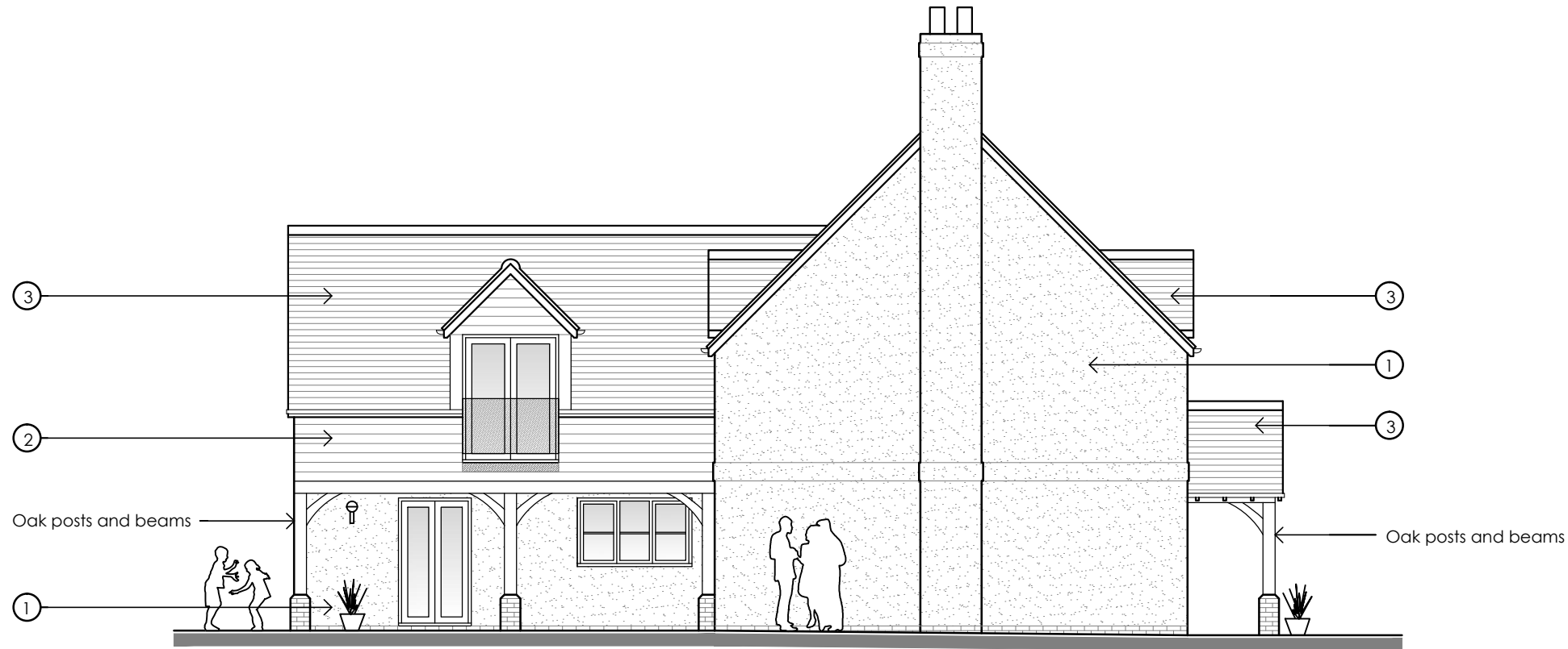
LEFT FLANK ELEVATION