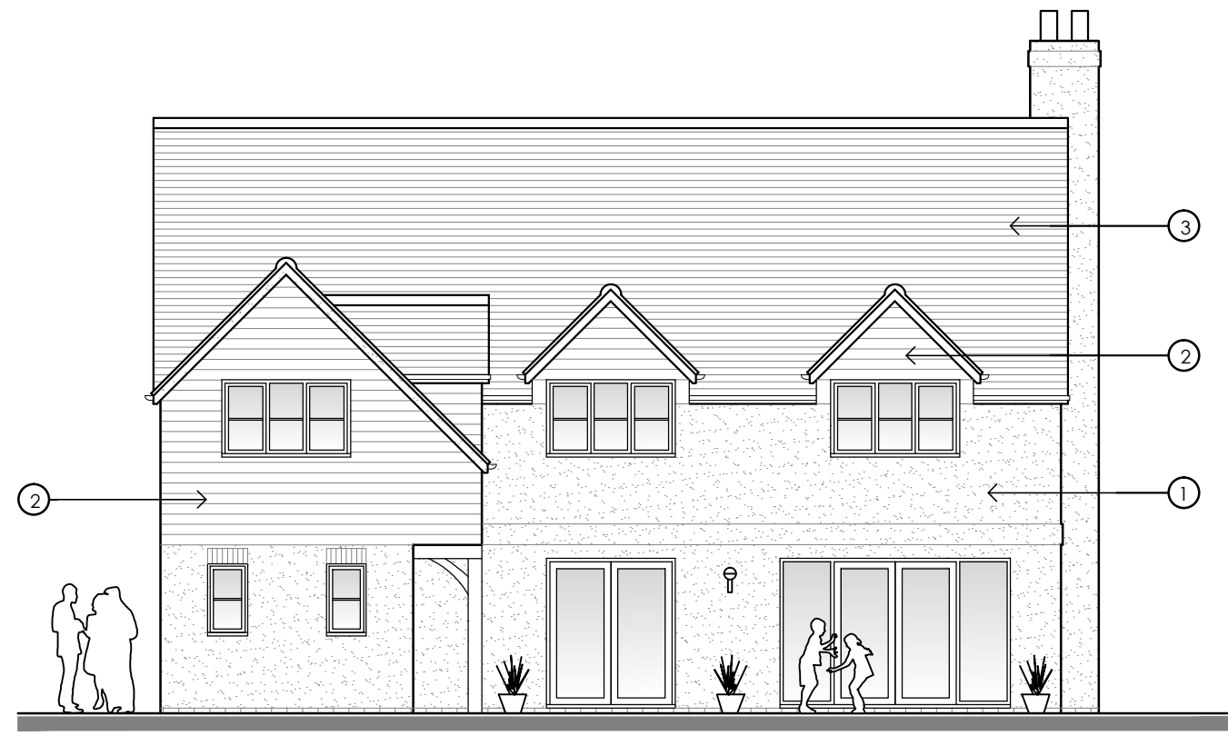
R E A R E L E V A T I O N

MATERIALS KEY: 1. Off white painted sand and cement render. 2. Weatherboard cladding RAL 7031 blue/grey. 3. Plain concrete tiles to match existing. RAL 7031 blue/grey PVC windows and patio doors. Natural oak front door. Natural oak post and beam supports. RAL 7031 blue/grey fascias and verges. Natural aluminium rainwater goods.