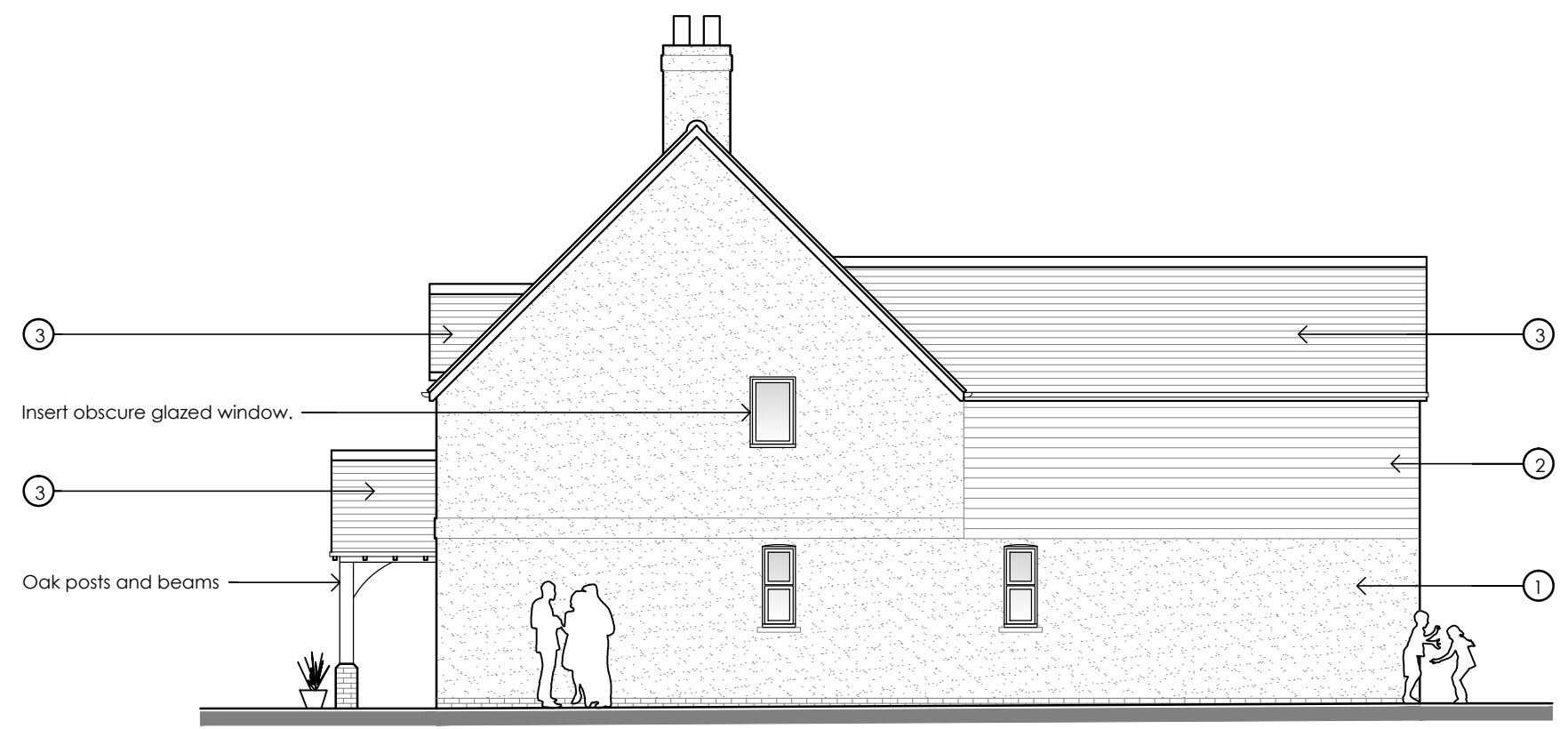
R I G H T F L A N K E L E V A T I O N