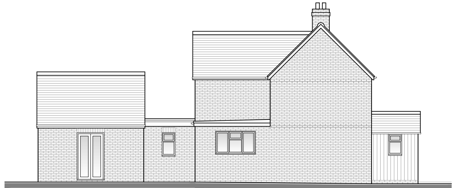
LEFT FLANK ELEVATION