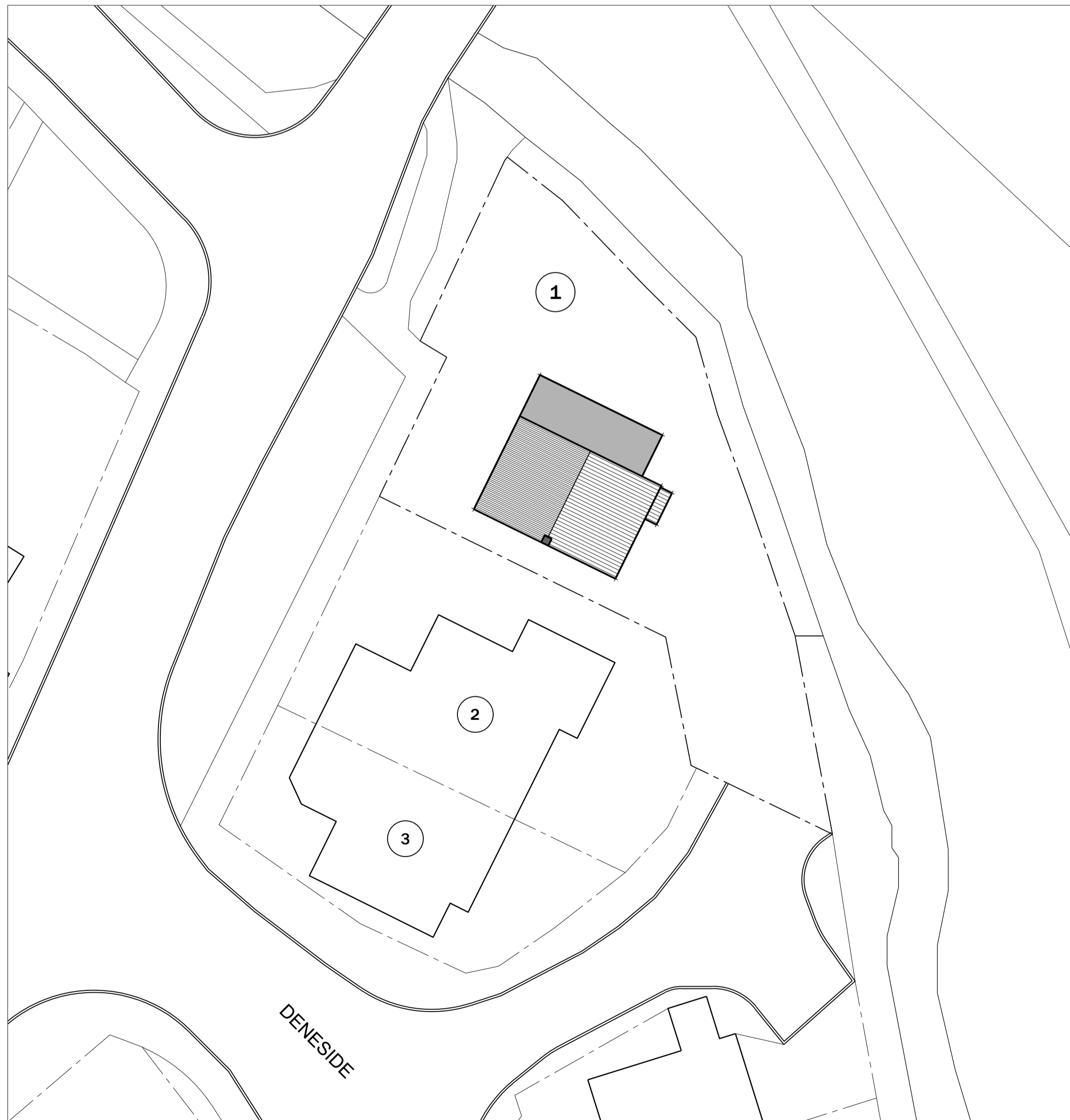
EXISTING SITE PLAN SCALE: 1:200

Date: 09/01/24 Scale: 1:1250 Map Centre: 416474.533585 Data updated: 01/11/23 Our Ref: 1361812 - 1 OS Background Plan A4