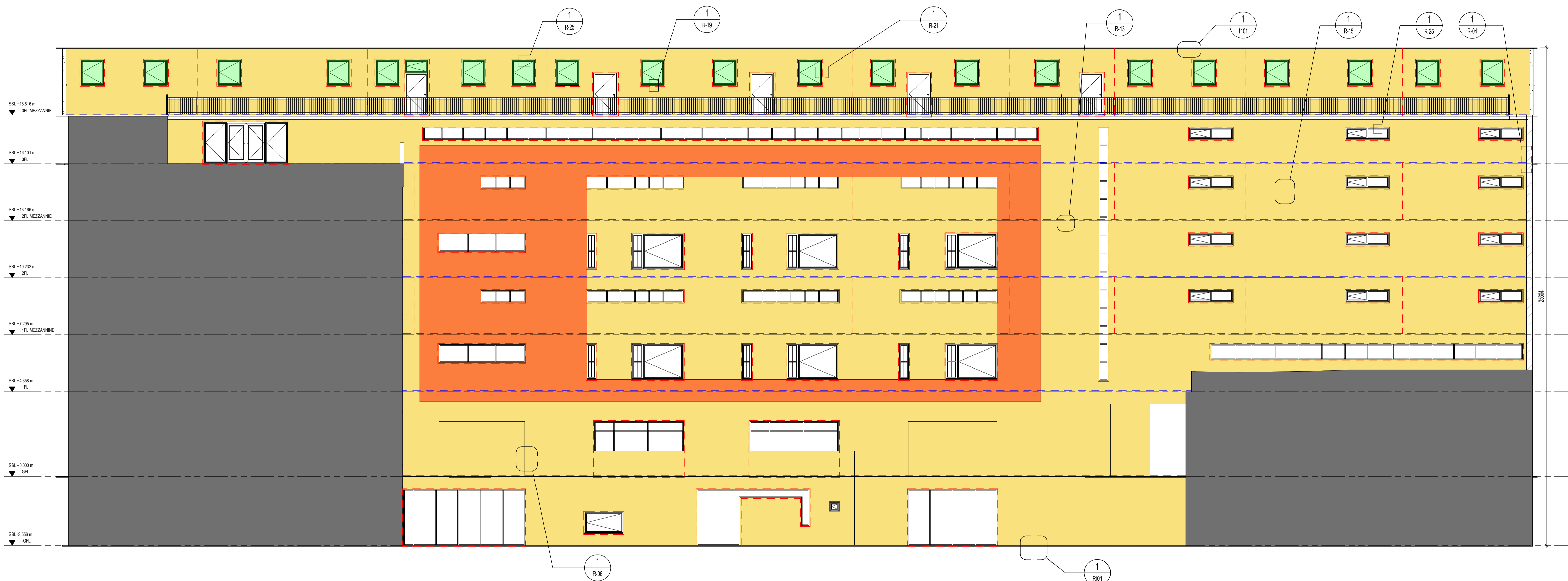
1 PROPOSED EAST FACING INTERNAL COURT-YARD ELEVATION 1:100