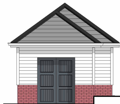
26 G1 West Existing 1 : 100