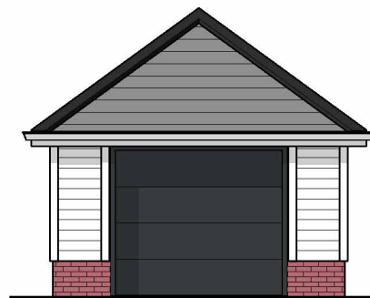
24 G1 East Existing 1 : 100