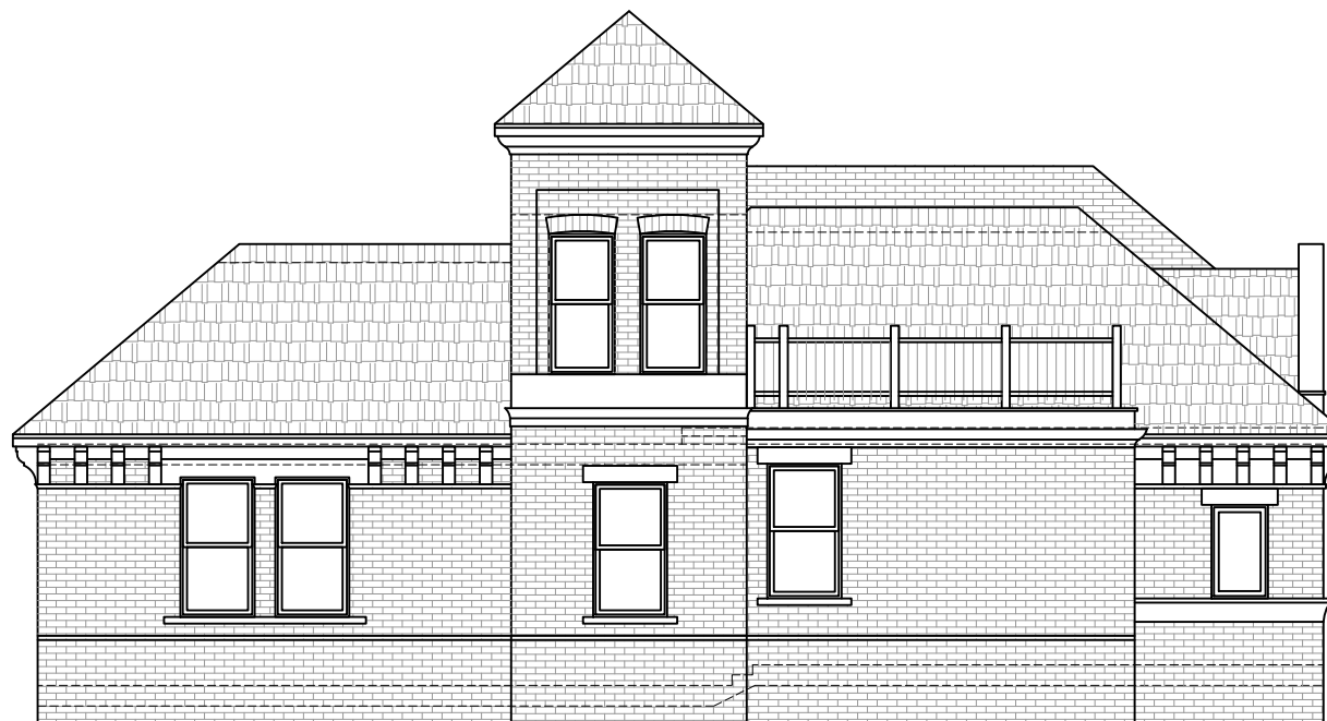
EXISTING LEFT SIDE ELEVATION