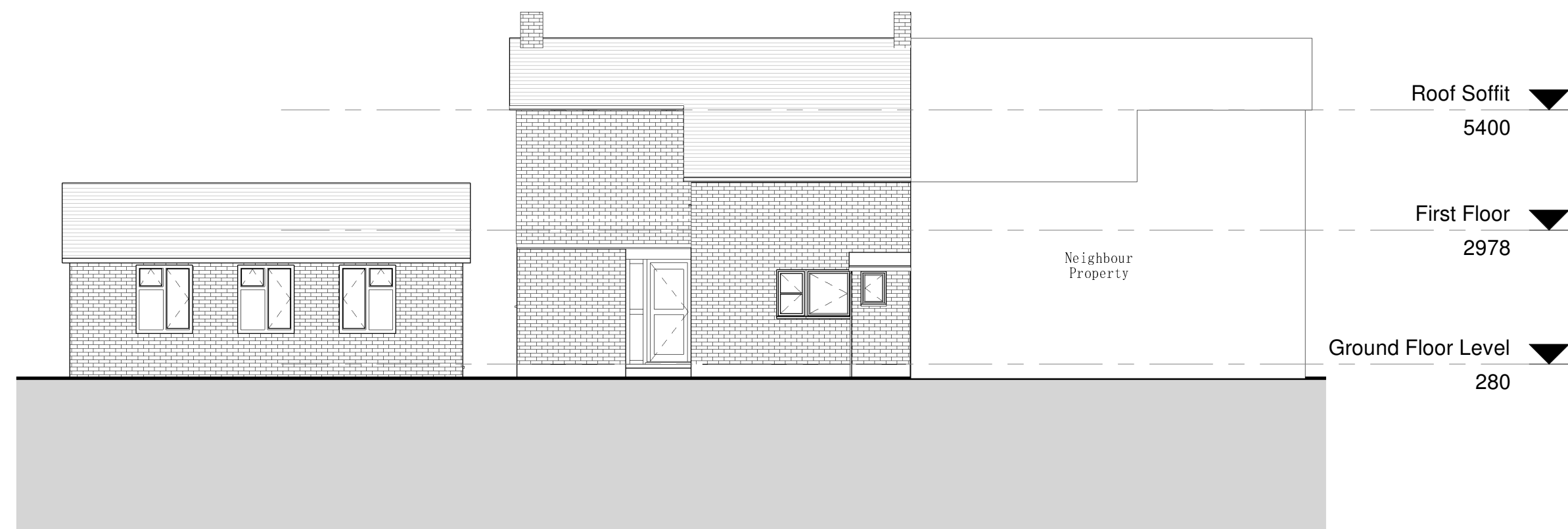
③ Proposed South Elevation 1 : 100