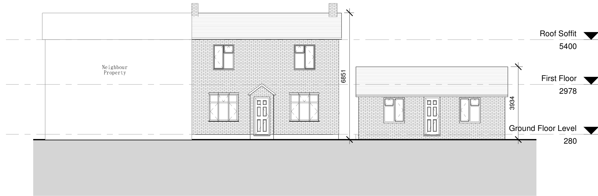
① Proposed North Elevation 1 : 100