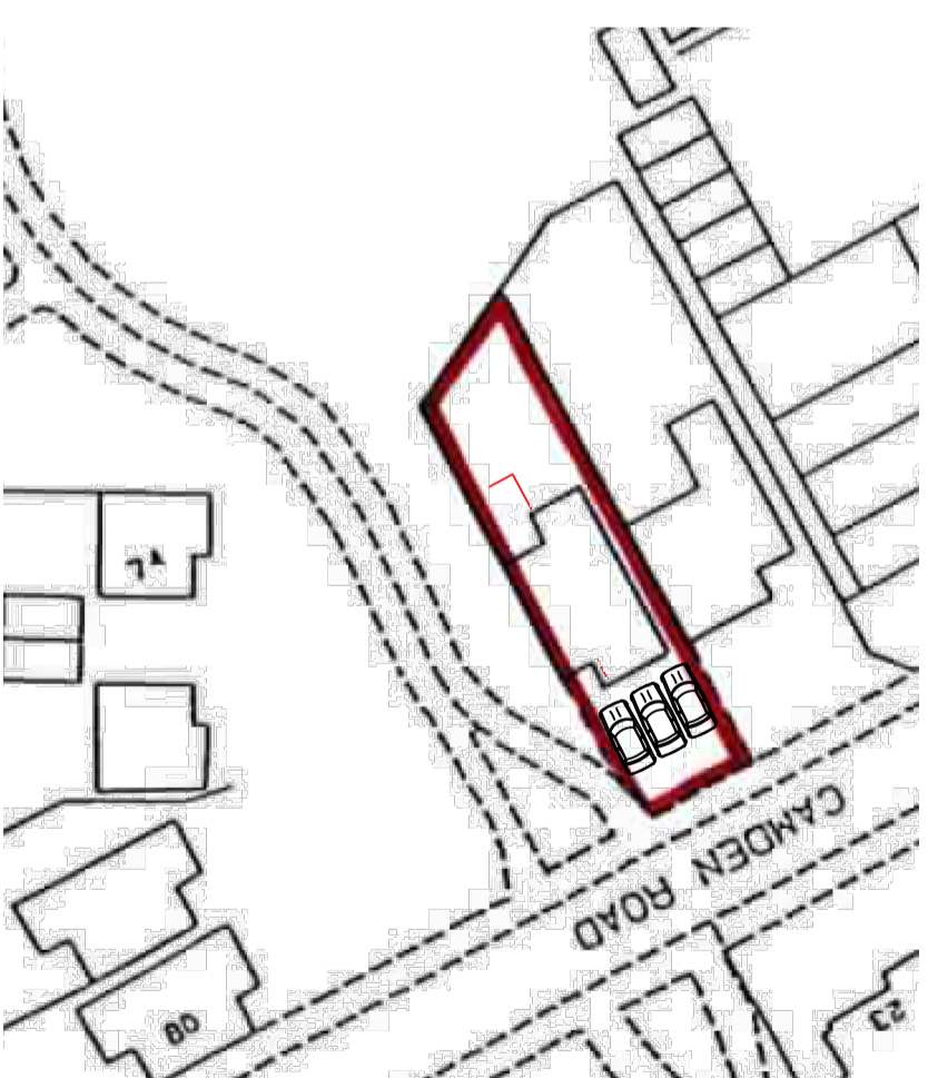
Site & Car Parking Plan 1:500