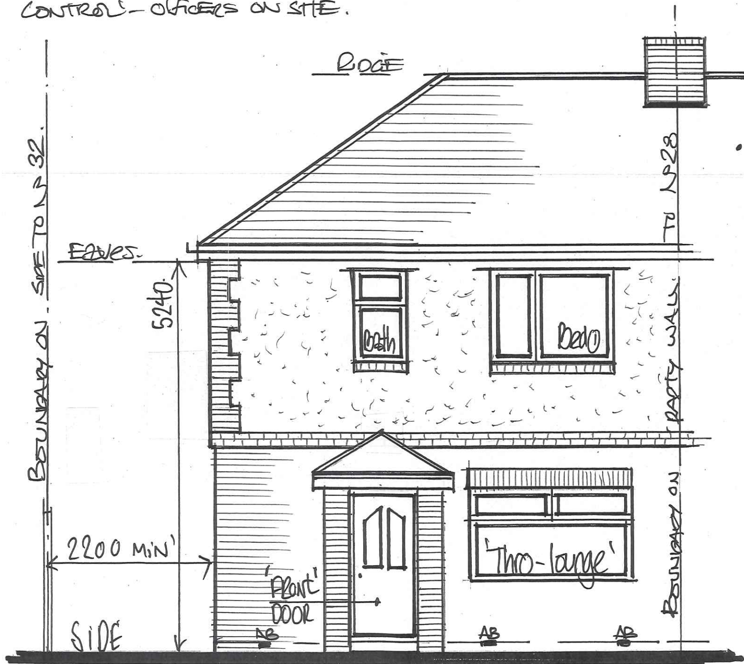
1:50 EXISTING "FRONT" ELEVATION

AGE OF PROPERTY - PRE WWII. AND OBSERVATIONS MADE @ TIME OF SURVEY WOULD SUGGEST THAT A COMBINED SYSTEM OF FW/SW PLANNED DRAINS EXISTS AND PRESUMABLY PASSES FROM REAR DOWN SIDE BETWEEN NPS 30 & 32 TOWARDS FRONT AND INTO MAIN SEWER ON COVELDAVE RD. PRIOR TO ANY WORKS COMMENCING ON SITE, CONTRACTORS TO UNLATE ALL EXISTING SOILSTACKS/DOWNPOSTS, GULLIES ETC TO ESTABLISH THE EXACT POSITION, DIRECTION / DEPTH AND INVERT LEVELS OF DRAINS AND ARRANGE TO UPGRADE. EXTEND AND MODIFY DRAINAGE TO SUIT PROPOSED WORKS AND SANITARY INSTALLATION AND AWAITS TO FULL SATISFACTION OF BUILDING CONTROLS - OFFICERS ON SITE.