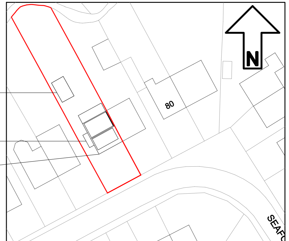
Site plan 1:500

Front elevation extension (less than 3 m2)