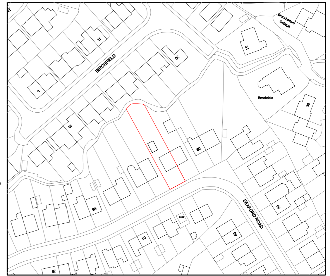
Location plan 1:1250

New render finish to front elevation with brick slips to gable corner. Ground floor windows to be renewed.