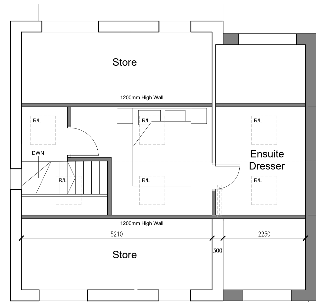
PROPOSED LOFT PLAN