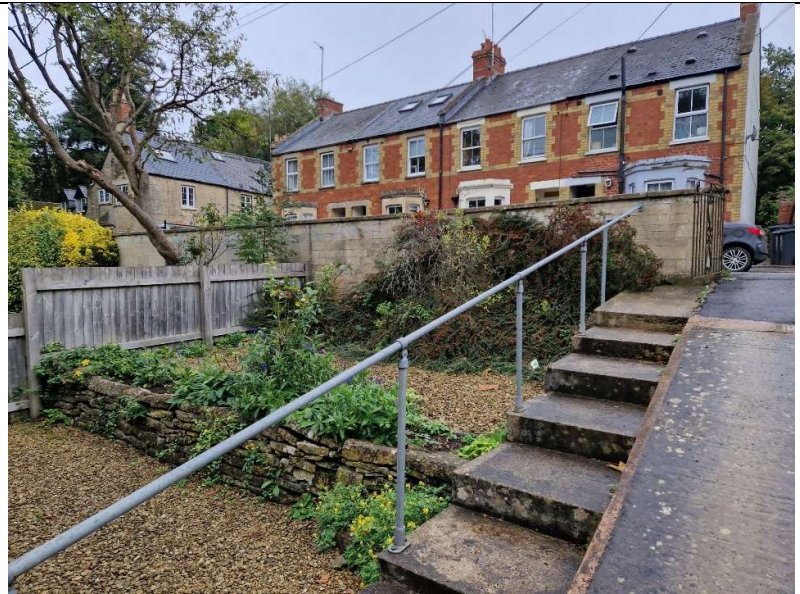
3. View of front garden, showing level change from road