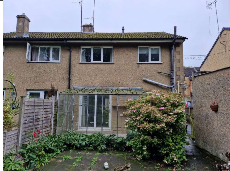
2. Rear elevation