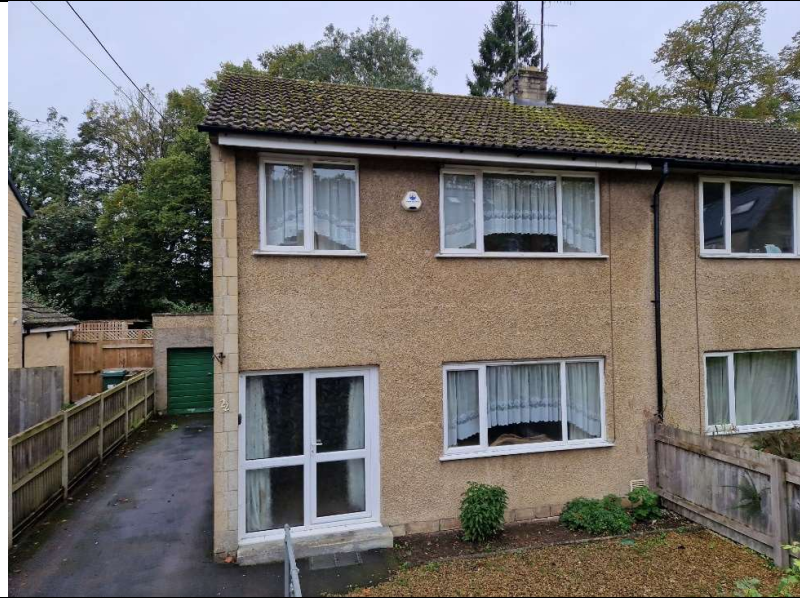
1. Front elevation