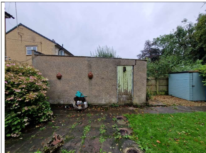
5. Side view of garage, to be demolished