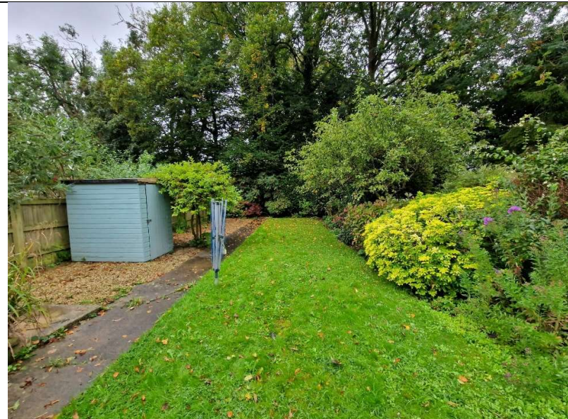
4. View of rear garden