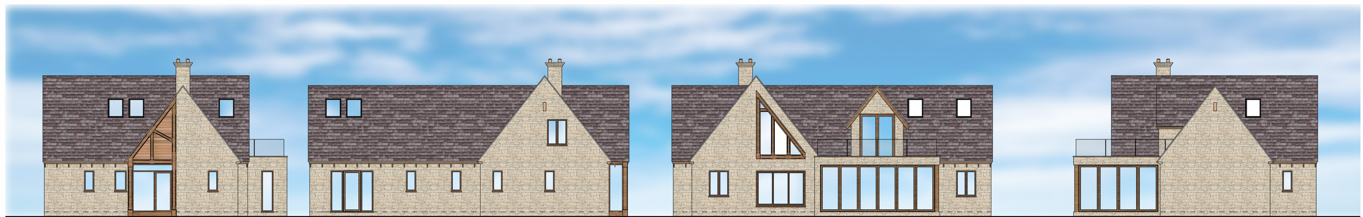
PROPOSED FRONT ELEVATION - 1 : 100