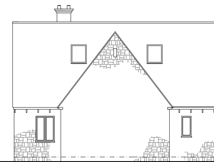
EXISTING SIDE ELEVATION - 1 : 100

NOTES: RESPONSIBILITY IS NOT ACCEPTED FOR ERRORS MADE BY OTHERS IN SCALING FROM THIS DRAWING. ALL CONSTRUCTION INFORMATION SHOULD BE TAKEN FROM FIGURED DIMENSIONS ONLY. NO WARRANTY AS TO THE PRECISION OF THIS DRAWING IS GIVEN NOR SHOULD BE INFERRED. CONSTRUCTION DRAWINGS TO BE READ IN CONJUNCTION WITH SPECIFICATIONS, SCHEDULES AND DRAWINGS FROM STRUCTURAL AND MECHANICAL ENGINEERS.