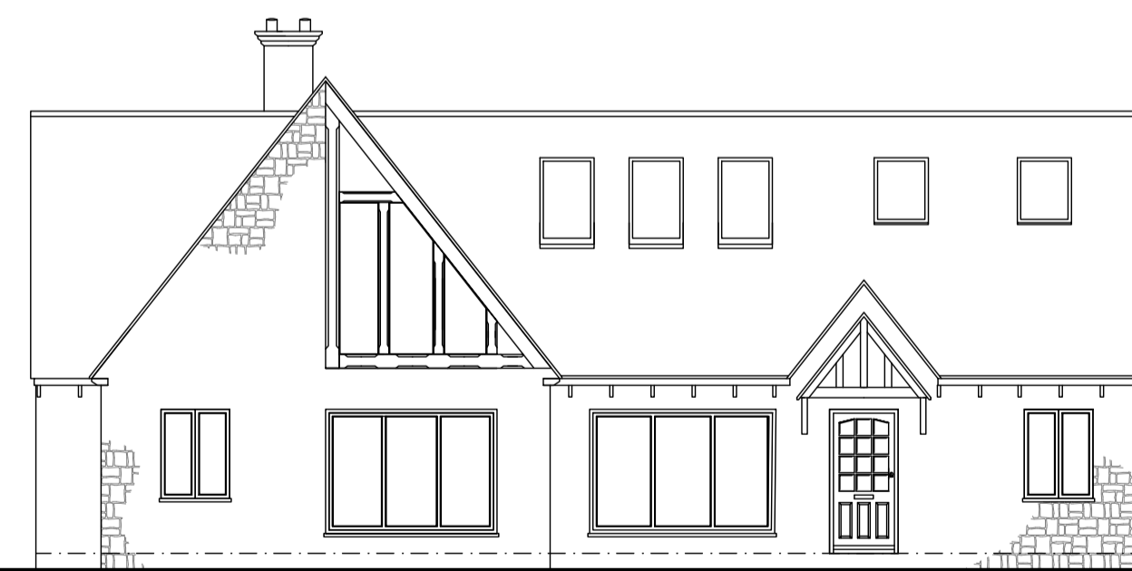
EXISTING REAR ELEVATION - 1 : 100