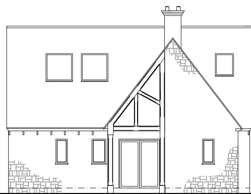
EXISTING FRONT ELEVATION - 1 : 100