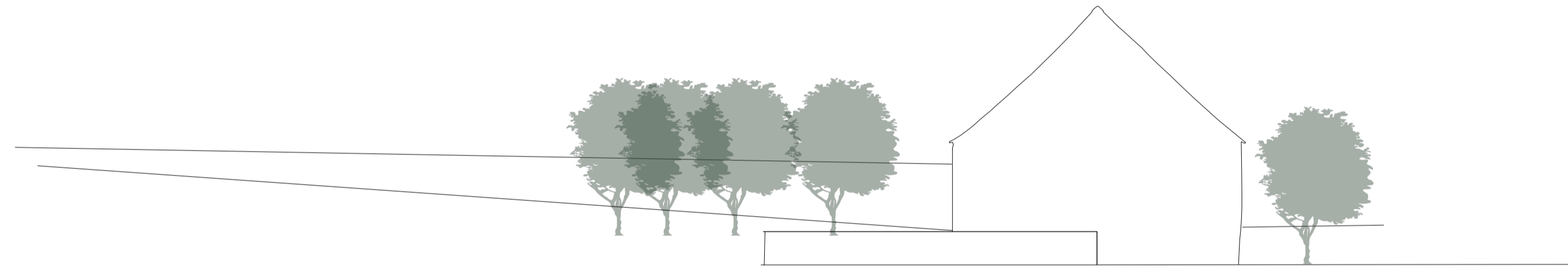
South - West Elevation from Church Farm