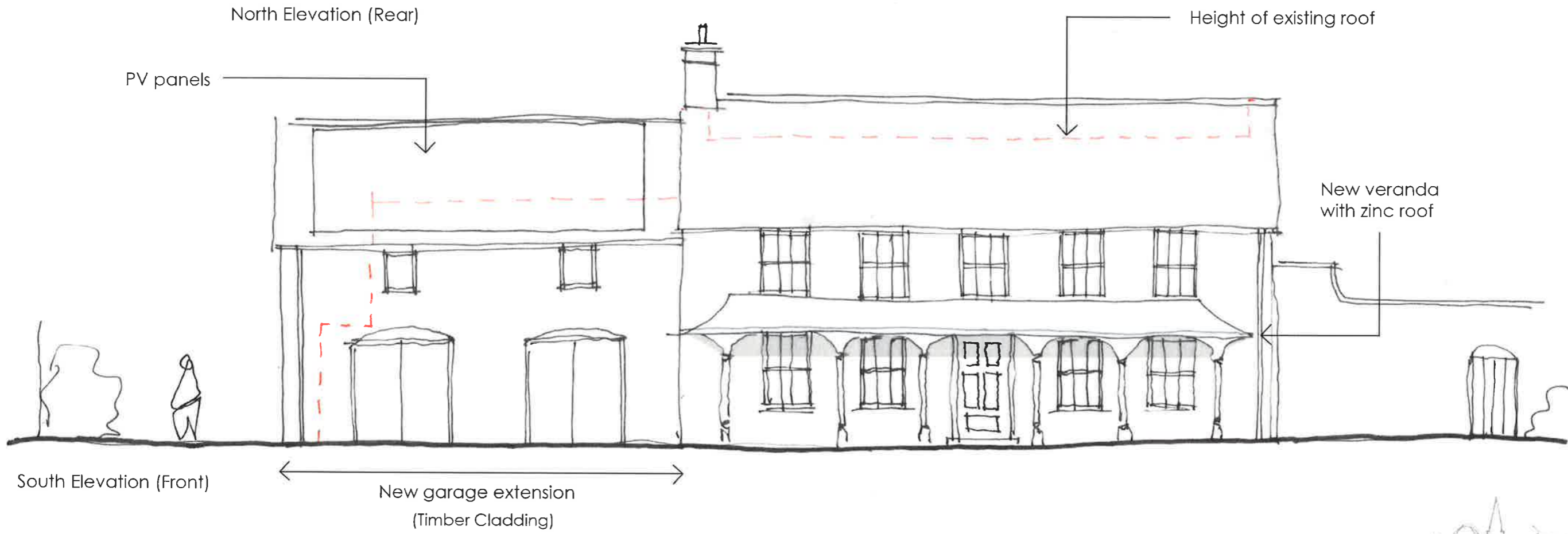
South Elevation (Front)