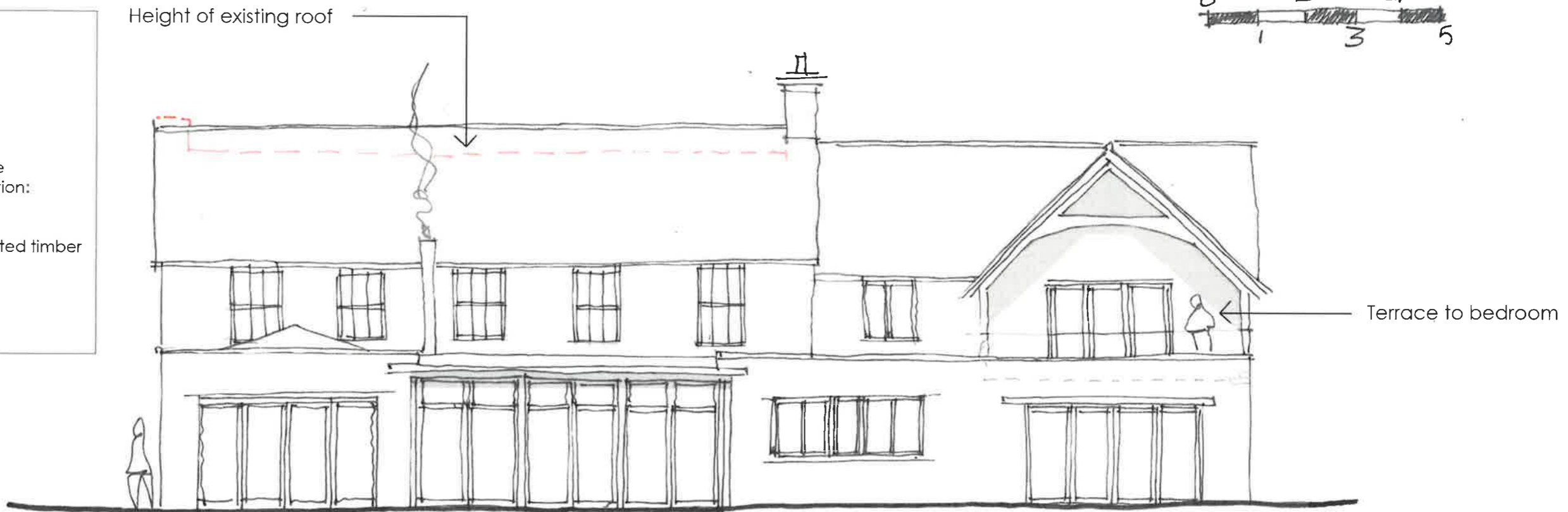
North Elevation (Rear)