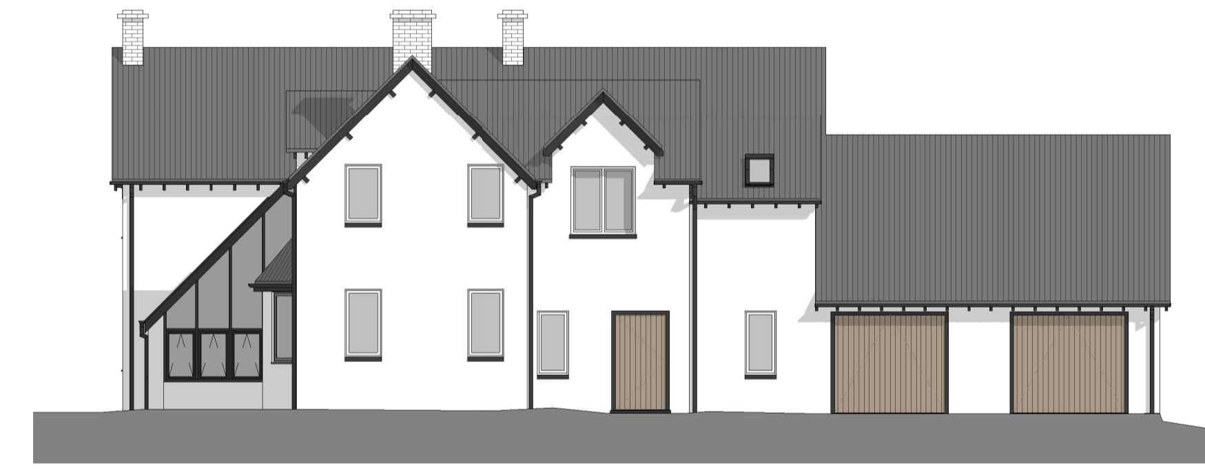
4 Proposed East Elevation 1 : 100