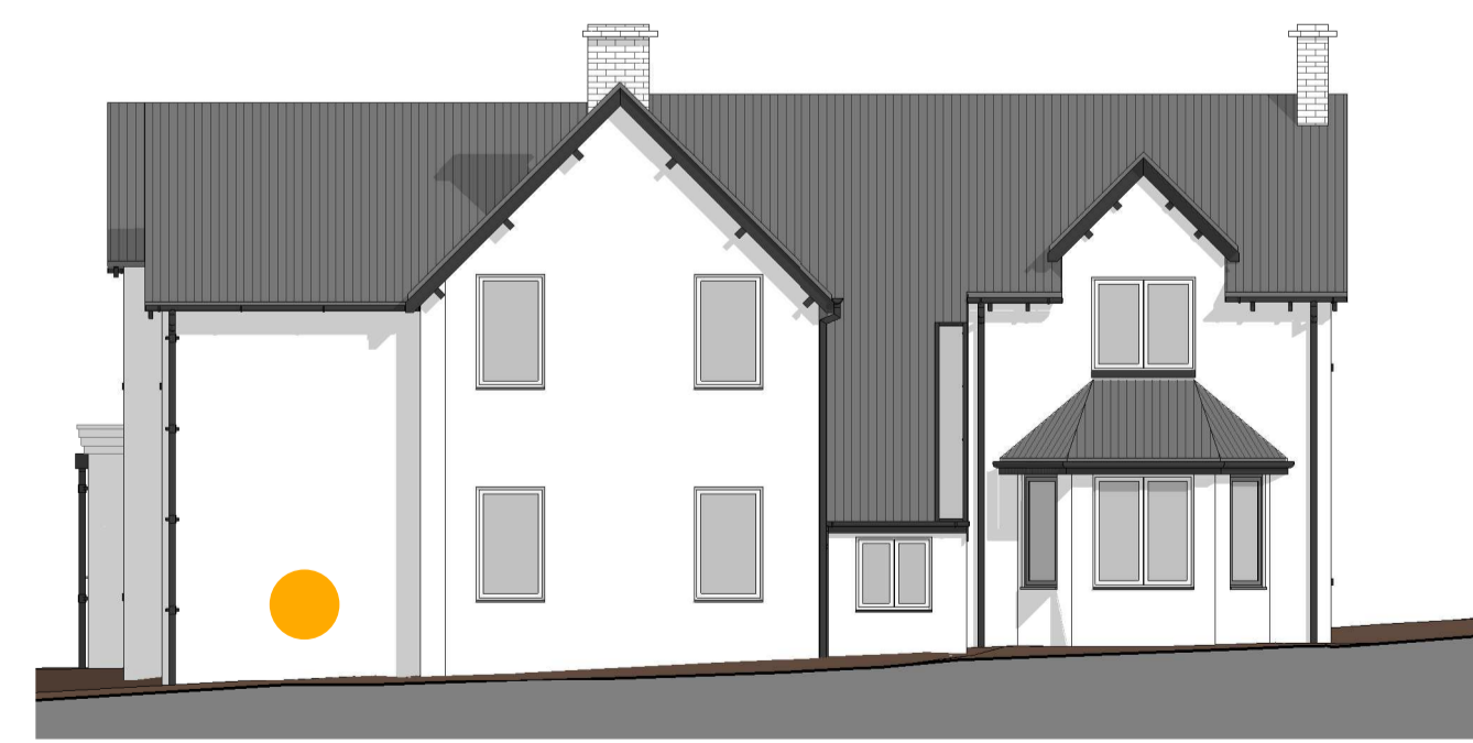
6 Proposed South Elevation 1 : 100