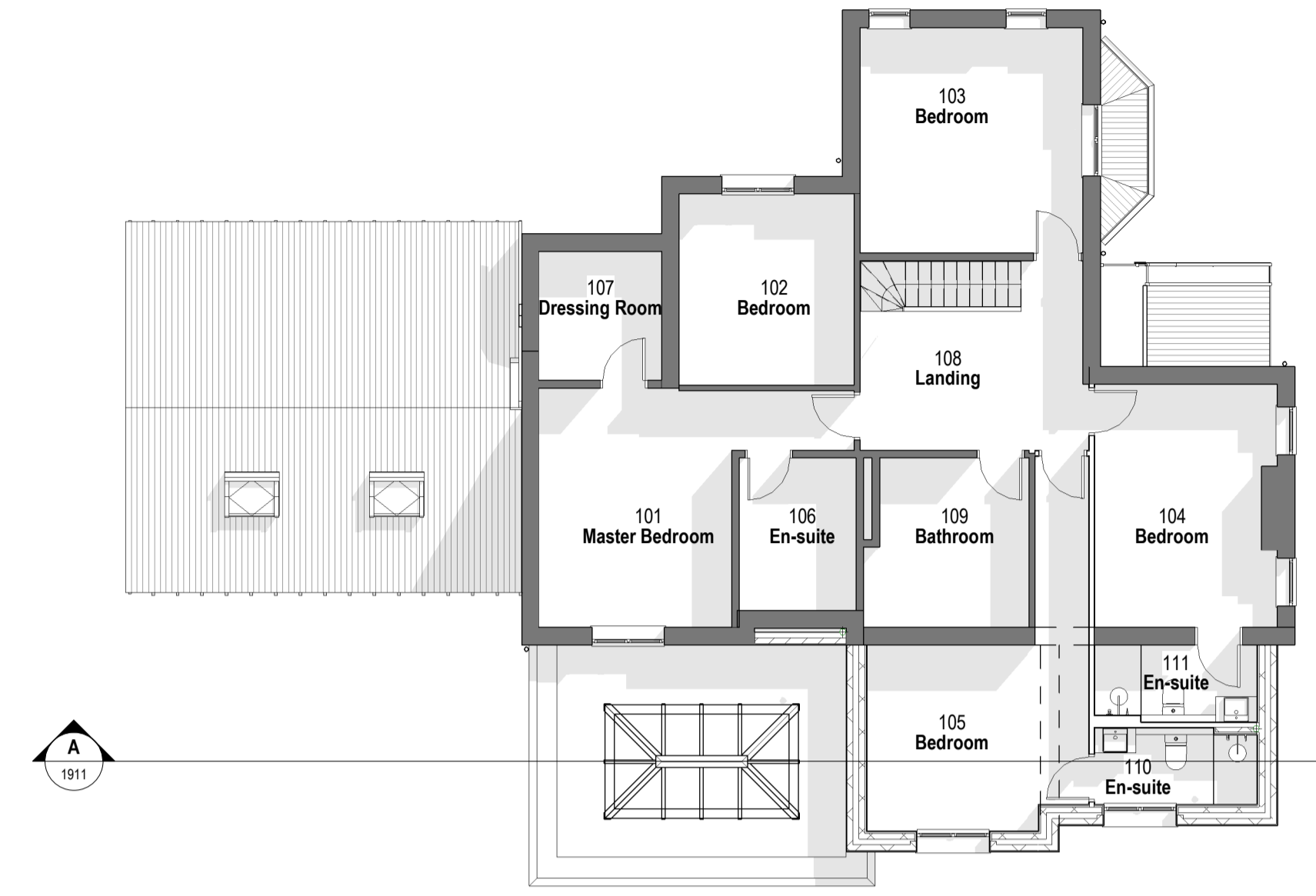
2 Proposed First Floor 1 : 100