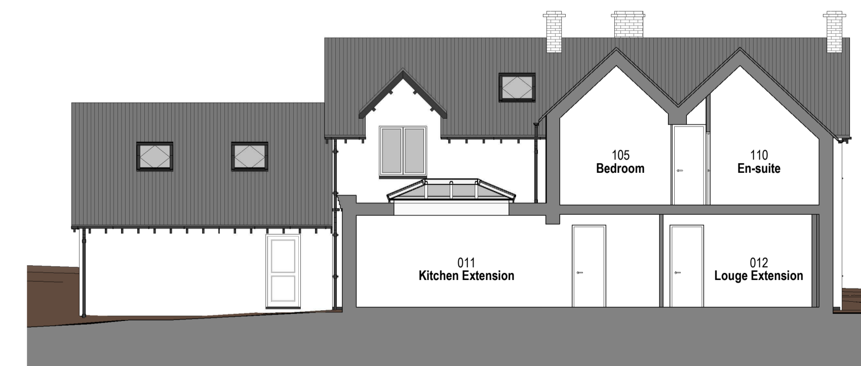
A Proposed Section A 1 : 100