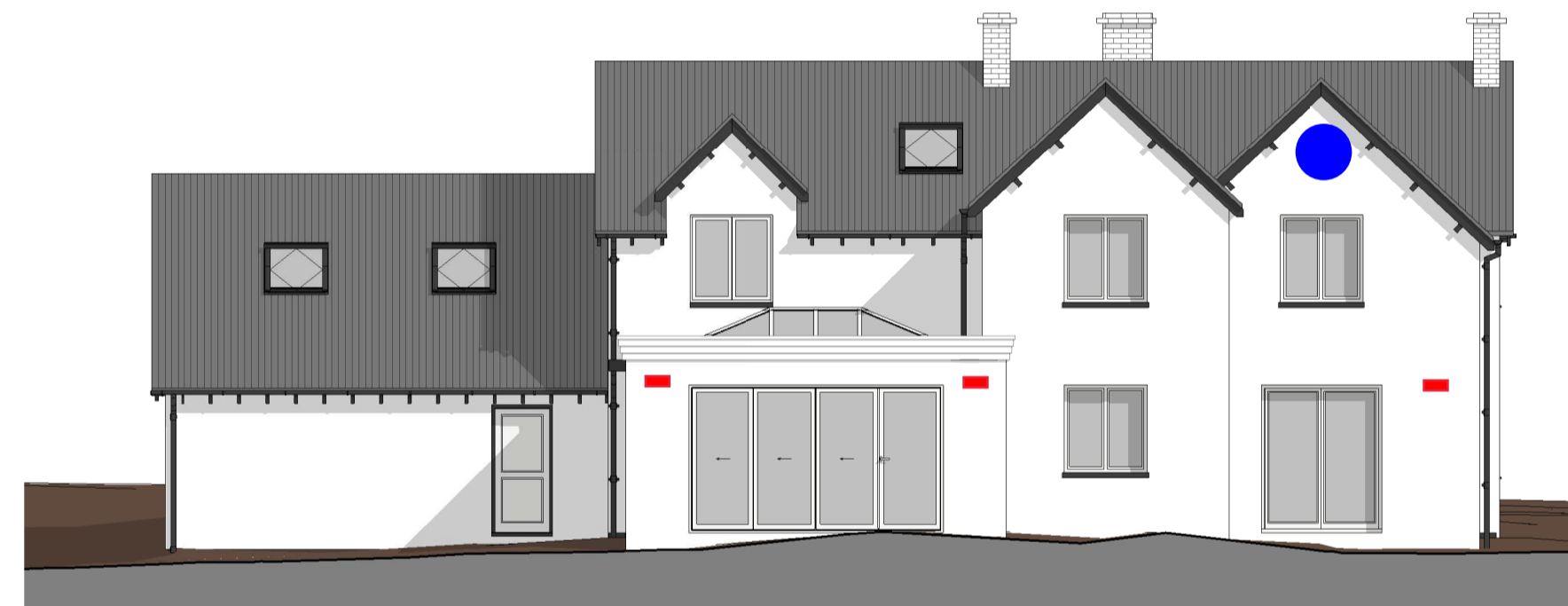
3 Proposed West Elevation 1 : 100