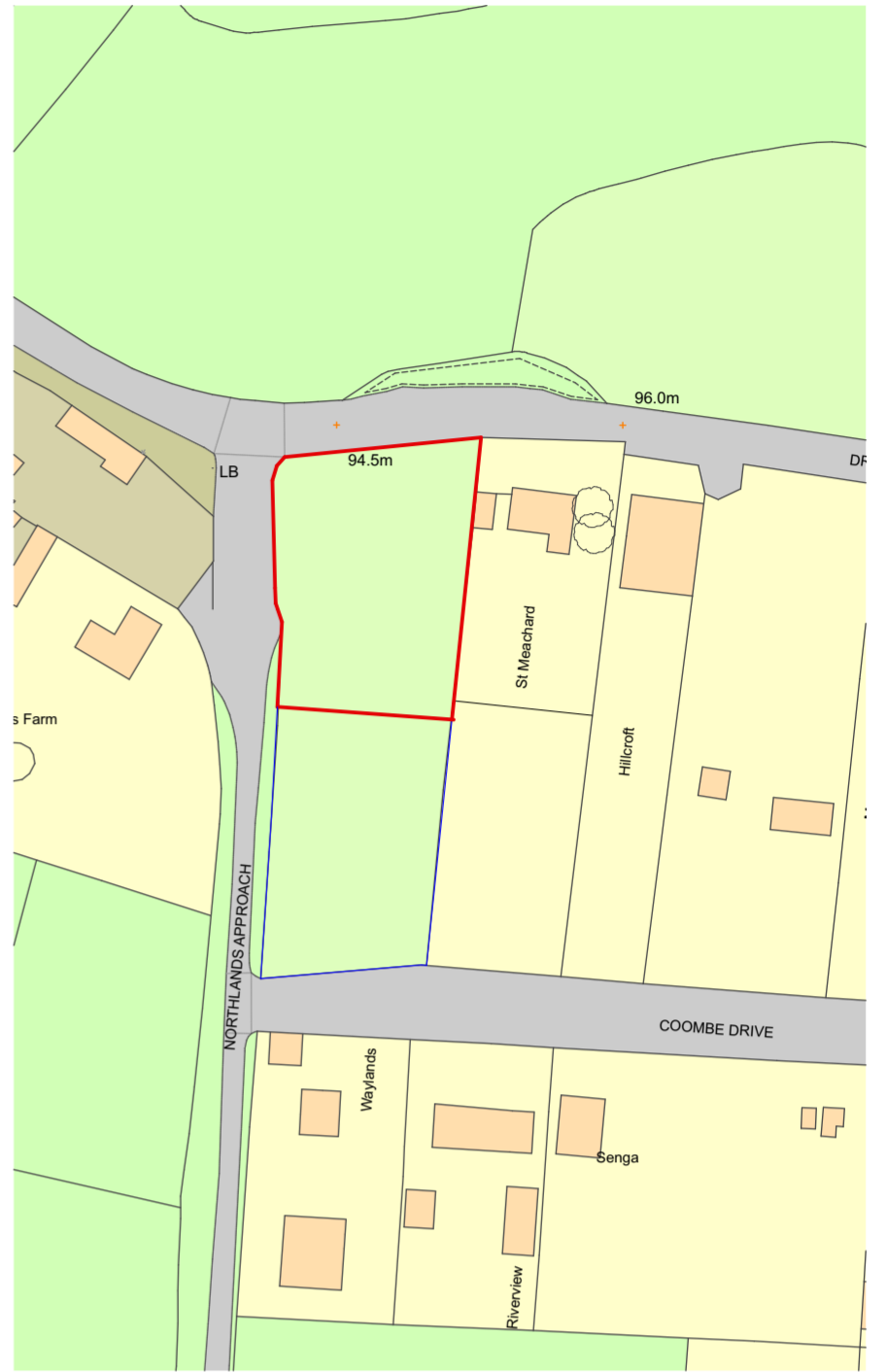
As Existing Site Location Plan 1:1250