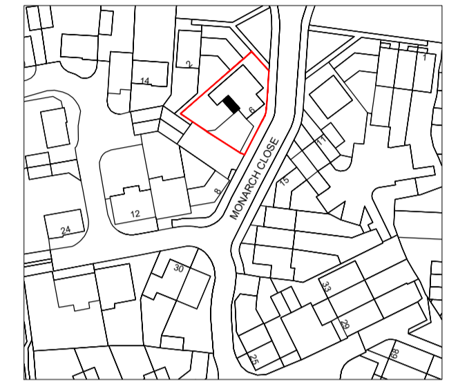
Proposed Location Plan - 1:1250