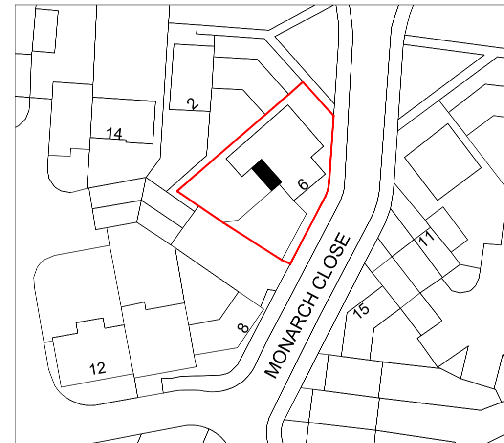
Proposed Block Plan - 1:500