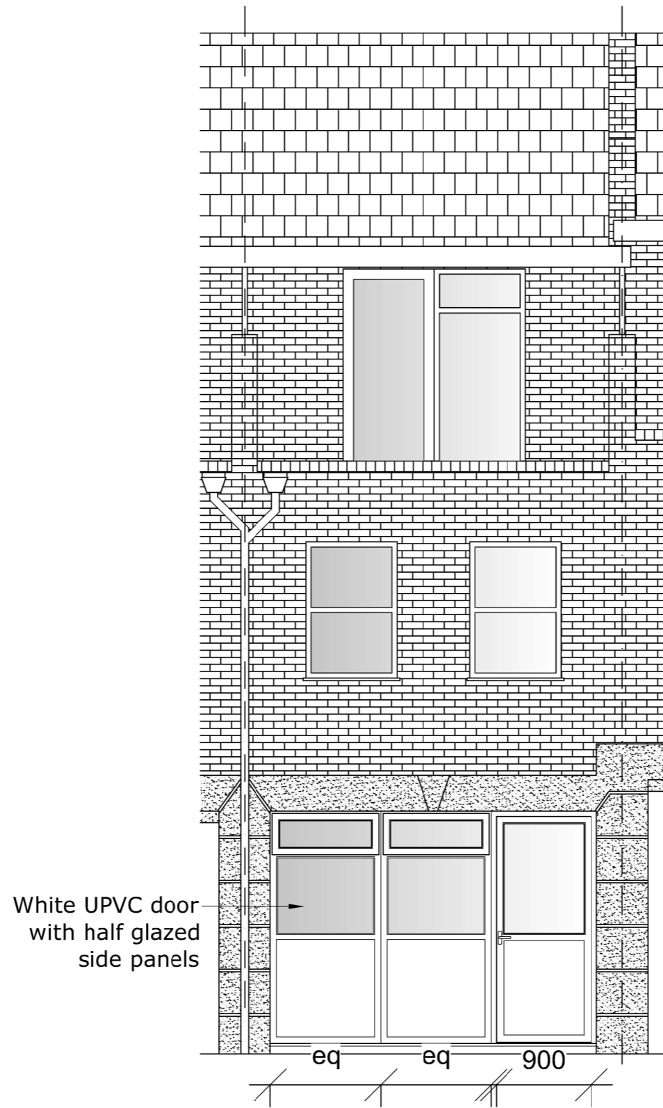
PROPOSED ELEVATION 1 : 50