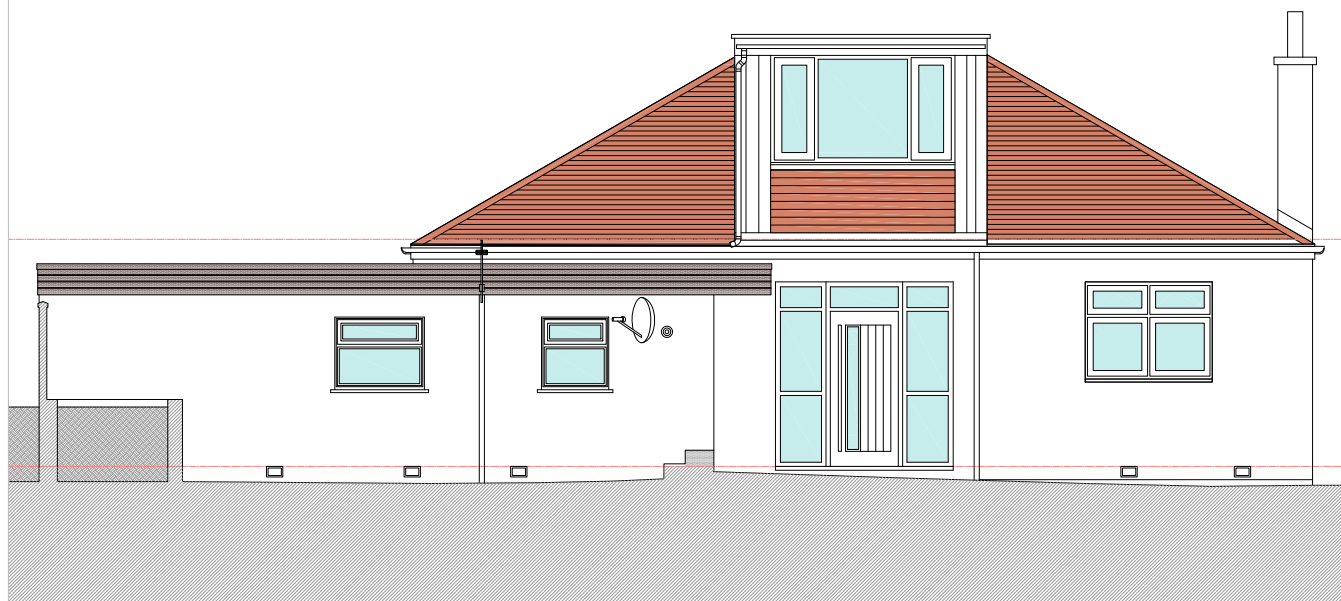
3 East Elevation 1:100 @ A3