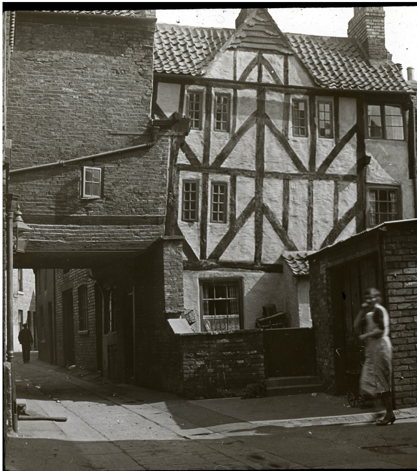
Figure 2 - 'Crazy Cottage' in 1953. The garage behind the lady is the location of the excavation carried out in 2005/06, the garage being on the site of 23 Quay Street

Prior to the erection of the boat builder's shed in about 1964/5 part of the site frontage to Quay Street (3.6m) was occupied by a timber framed building known locally as Crazy Cottage (variously numbered 25 or 27 Quay Street) illustrated in figure 2. On stylistic grounds, this building is thought to be late fourteenth or early fifteenth century in date. 4