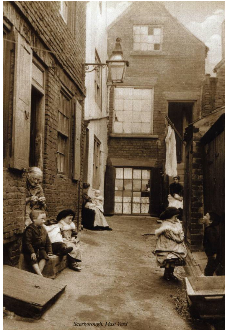
Figure 3 looking north into Mast Yard in the nineteenth century. Note the apparent break of slope in front of the window facing down the yard

Before the boat builders shed was built, the rest of the site was occupied by tenements known as Whartons Yard (the yard still partially exists behind the Golden Ball public house) and Mast Yard. These are likely to have been early eighteenth century buildings on earlier stone bases as at 34-35 Sandside. A nineteenth century photograph of Mast Yard – see figure 3 - appears to show a break of slope at its north end; this may be the same as the rise and fall found in some of the lanes between Quay Street and Sandside (eg alongside the former Bethel Mission Chapel). These rises and falls have been postulated to indicate the line of the medieval sea front. 5