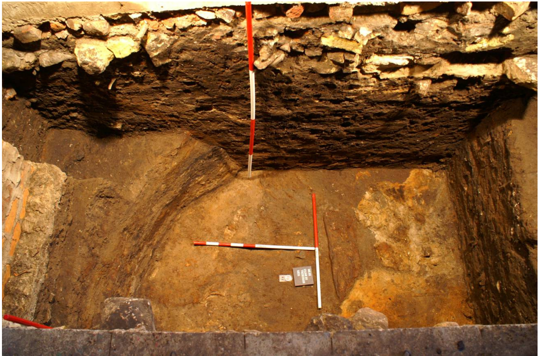
Figure 6 Trench 5 looking east showing the robbing cut Scales 2 metre and 1metre

Trench 3 was located to the south of the Marine Engineers shed and abutting 34-35 Sandside. This was a monitoring trench, observations being carried out during the demolition of a shed and the erection of a new brick built extension. Removal of the old shed has revealed a section of stone wall constructed in large squared coursed blocks providing the foundations to the brick building above. It is possible that this stone wall represented the re-used foundations of an earlier building but no definite evidence of this was found. The extension was built off a slab which involved lowering the older concrete floor slab by 300mm (400mm at the corners). The construction work was monitored and revealed that this area consisted of entirely twentieth century demolition fill to the full depth of the excavation.