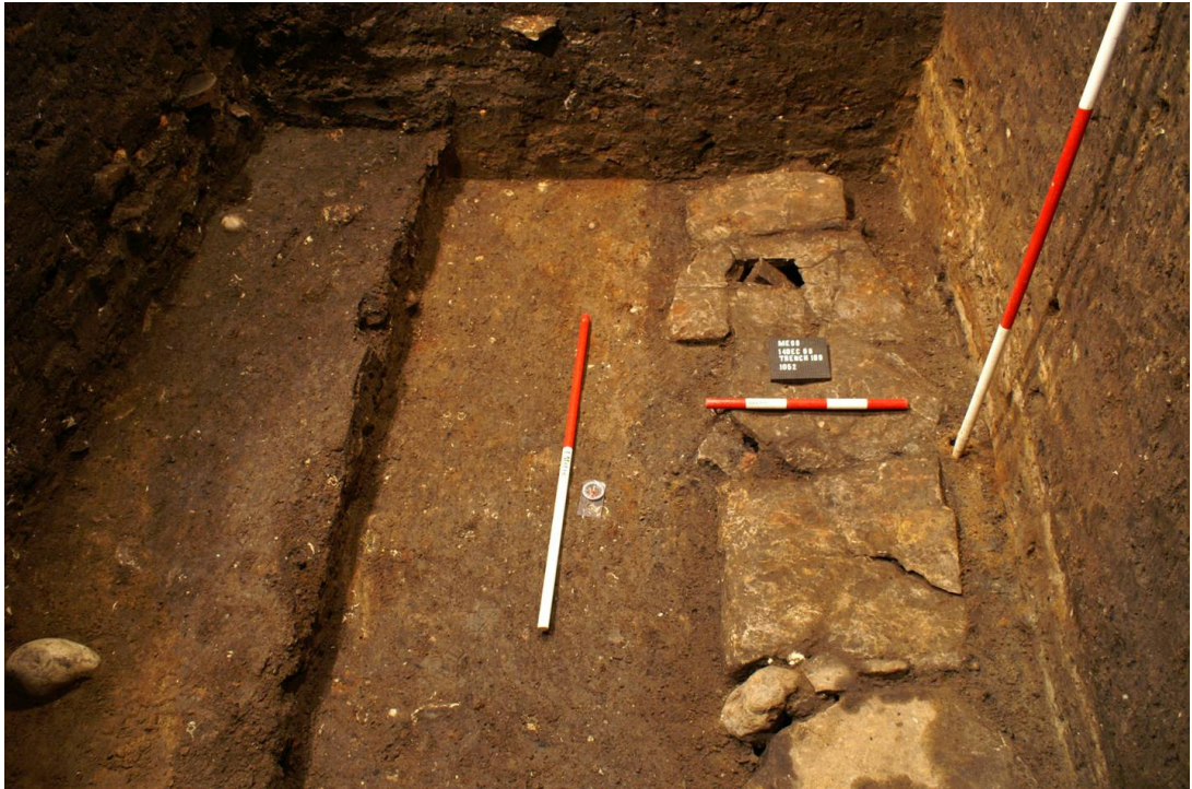
Figure 5 Trench 1 looking south showing the well constructed stone lined drain. Scales 2 metre, 1 metre and 500mm

Below the late medieval foundations in Trench 1 and throughout Trench 2 was a massive dump of soil, about 2.5m deep, representing a major episode of land reclamation in the late medieval period. Incorporated within the reclamation in trench 1 was a well-constructed stone-lined drain running north-south. Evidence from the excavations suggested that the rise in the modern ground surface is a reflection of a pre-existing dune system of which the reclamation took advantage.