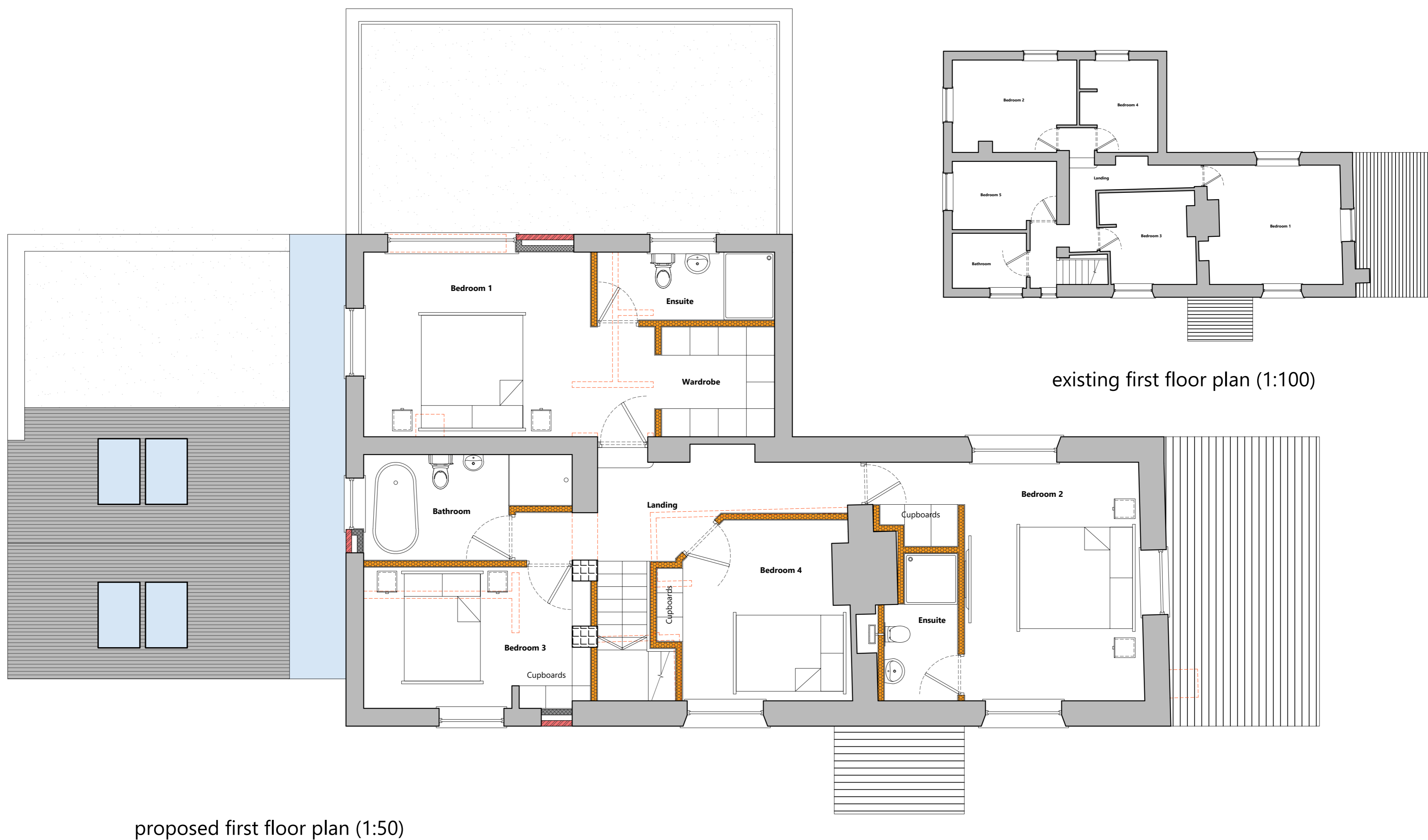
proposed first floor plan (1:50)