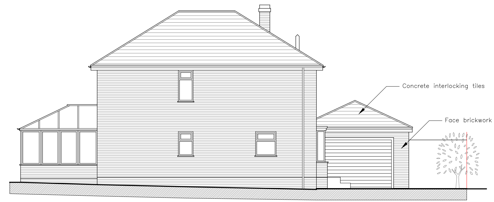
Left Side Elevation...