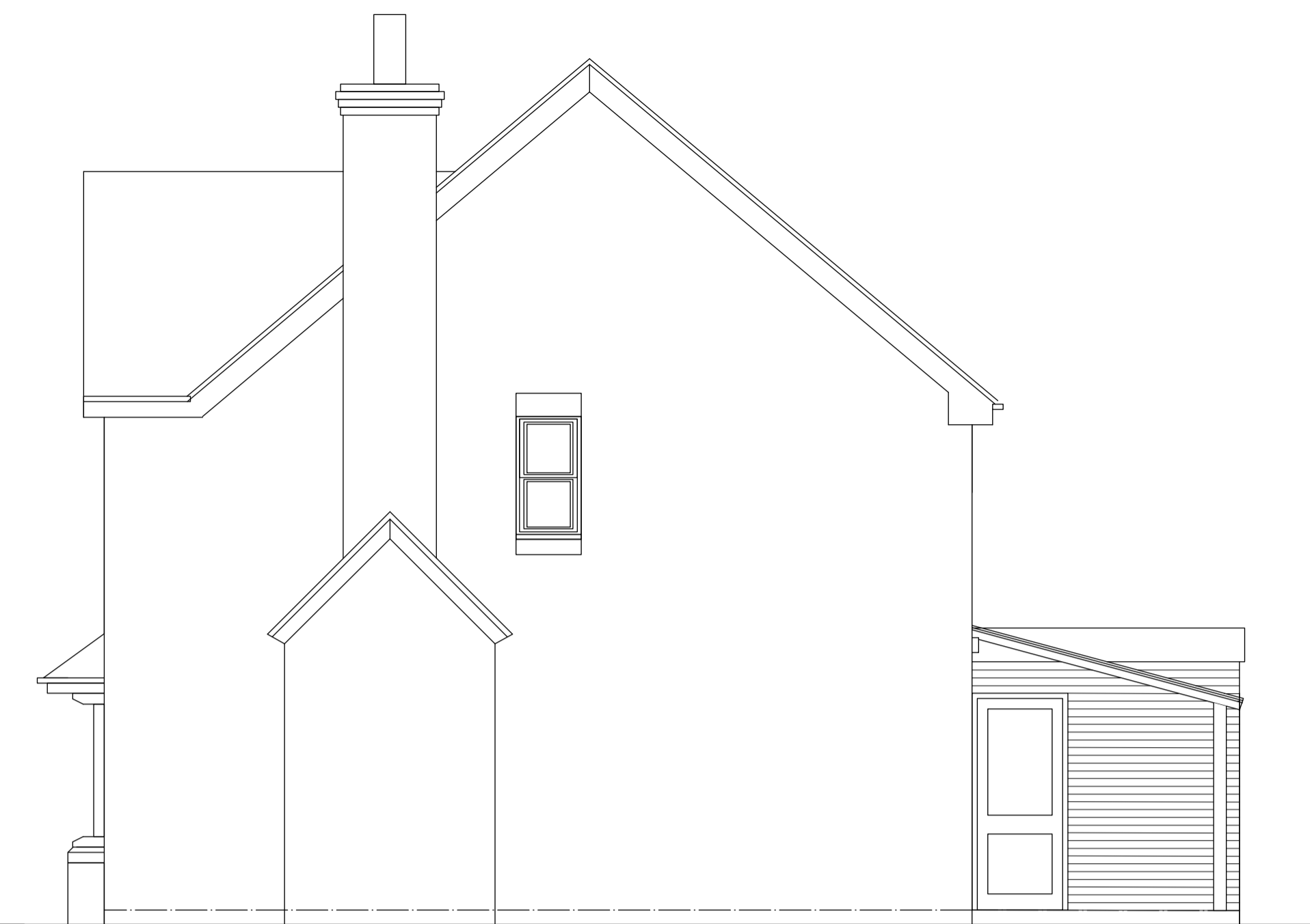
side - south elevation