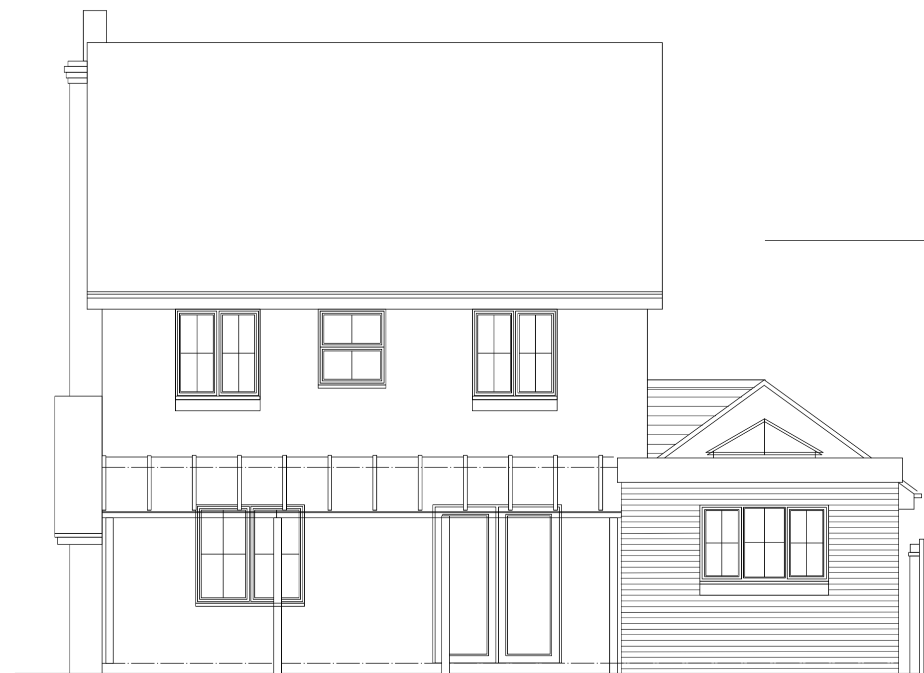
rear - east elevation