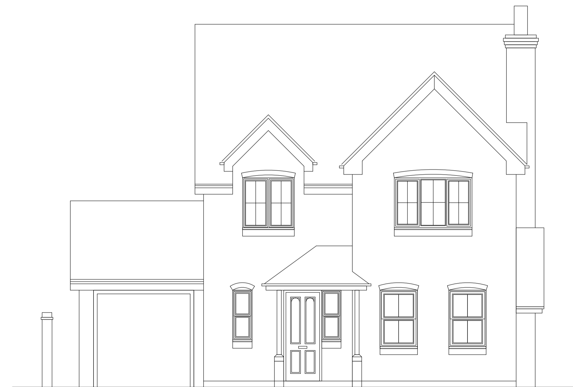
front - west elevation

qu-est design & planning Unit 7 Henry Close Battlefield Enterprise Park Shrewsbury Shropshire SY1 3TJ tel: 01743 469928 email: info@qu-est.co.uk web: www.qu-est.co.uk