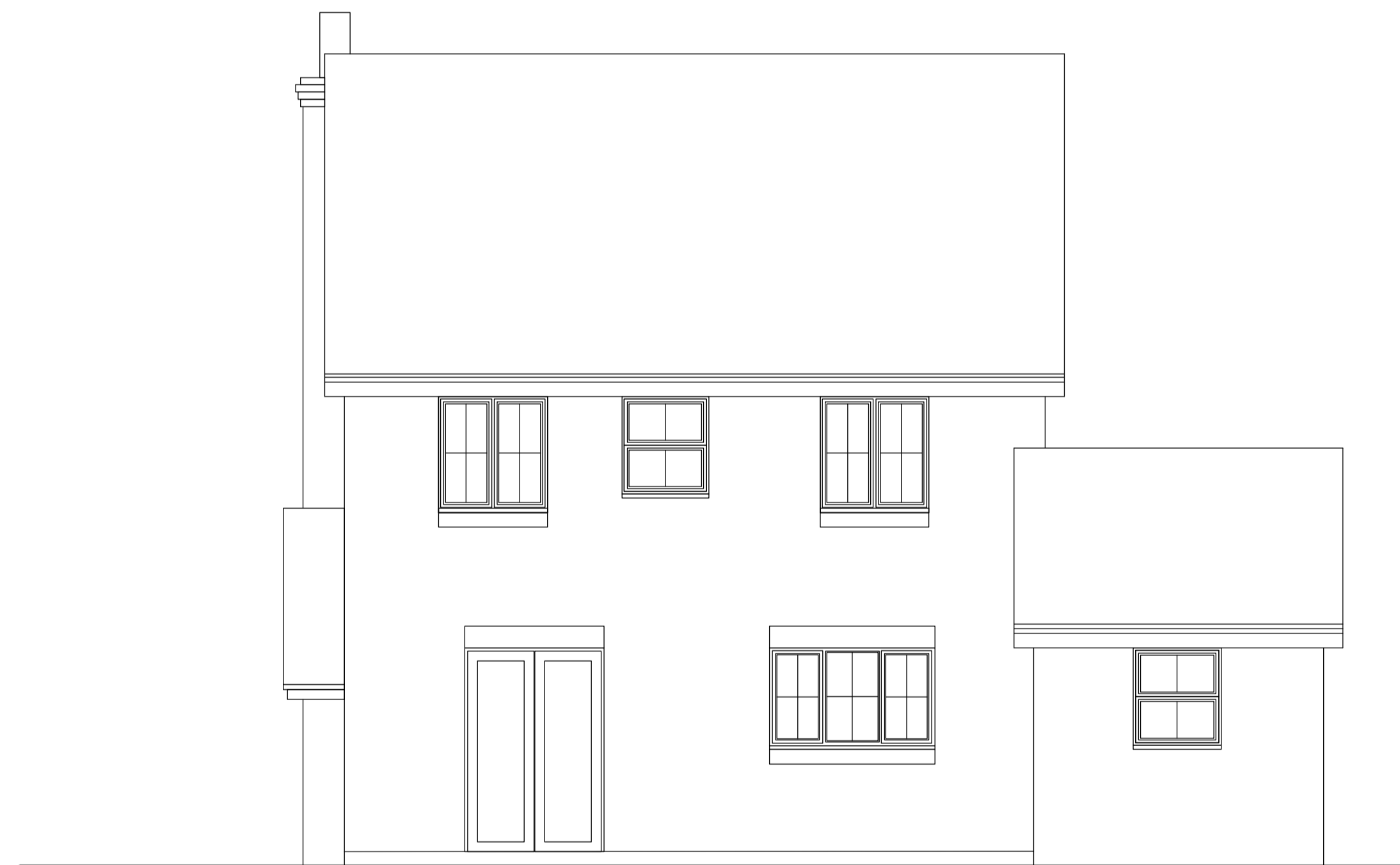
rear - east elevation