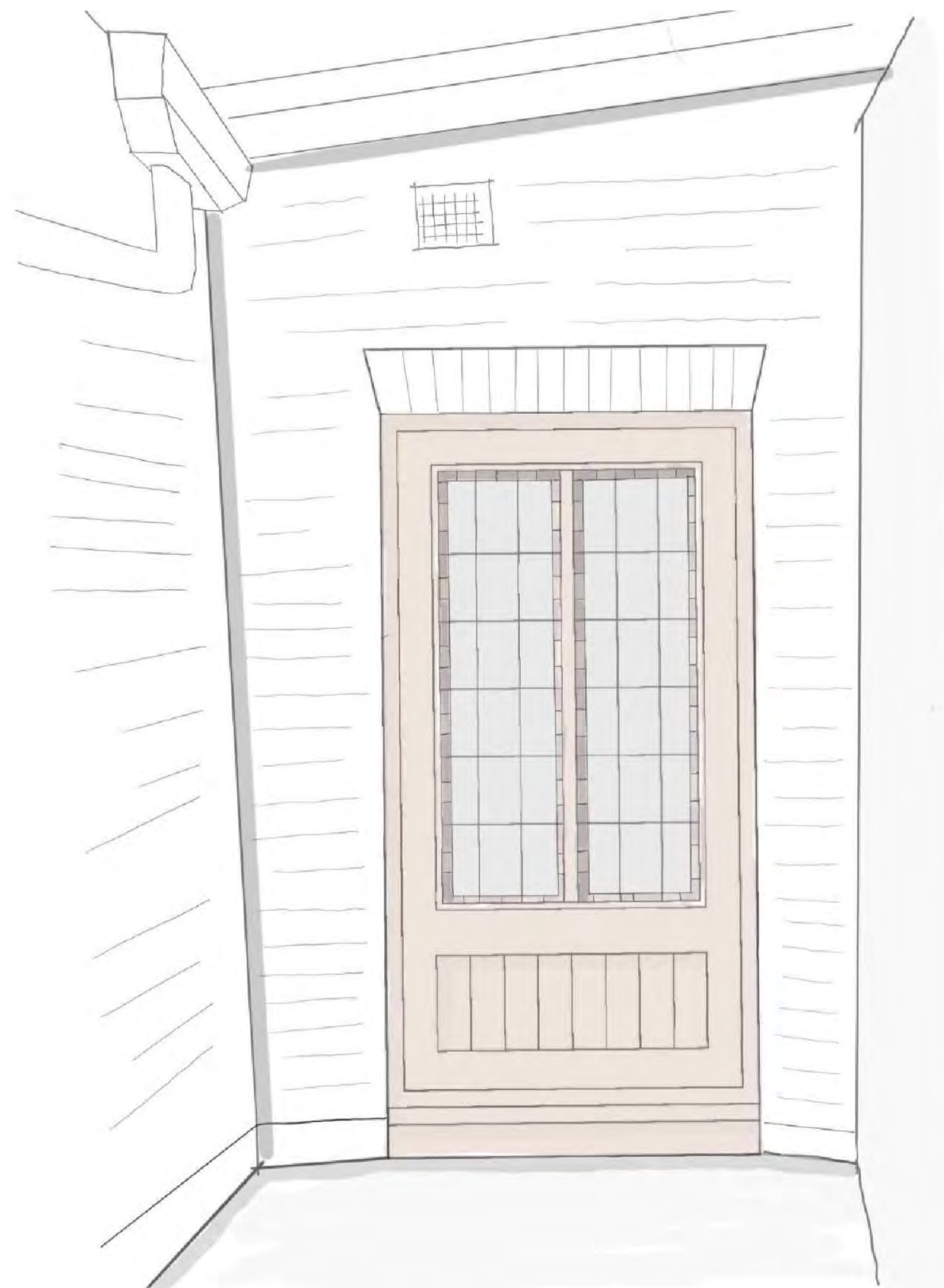
New door access to roof - As Proposed