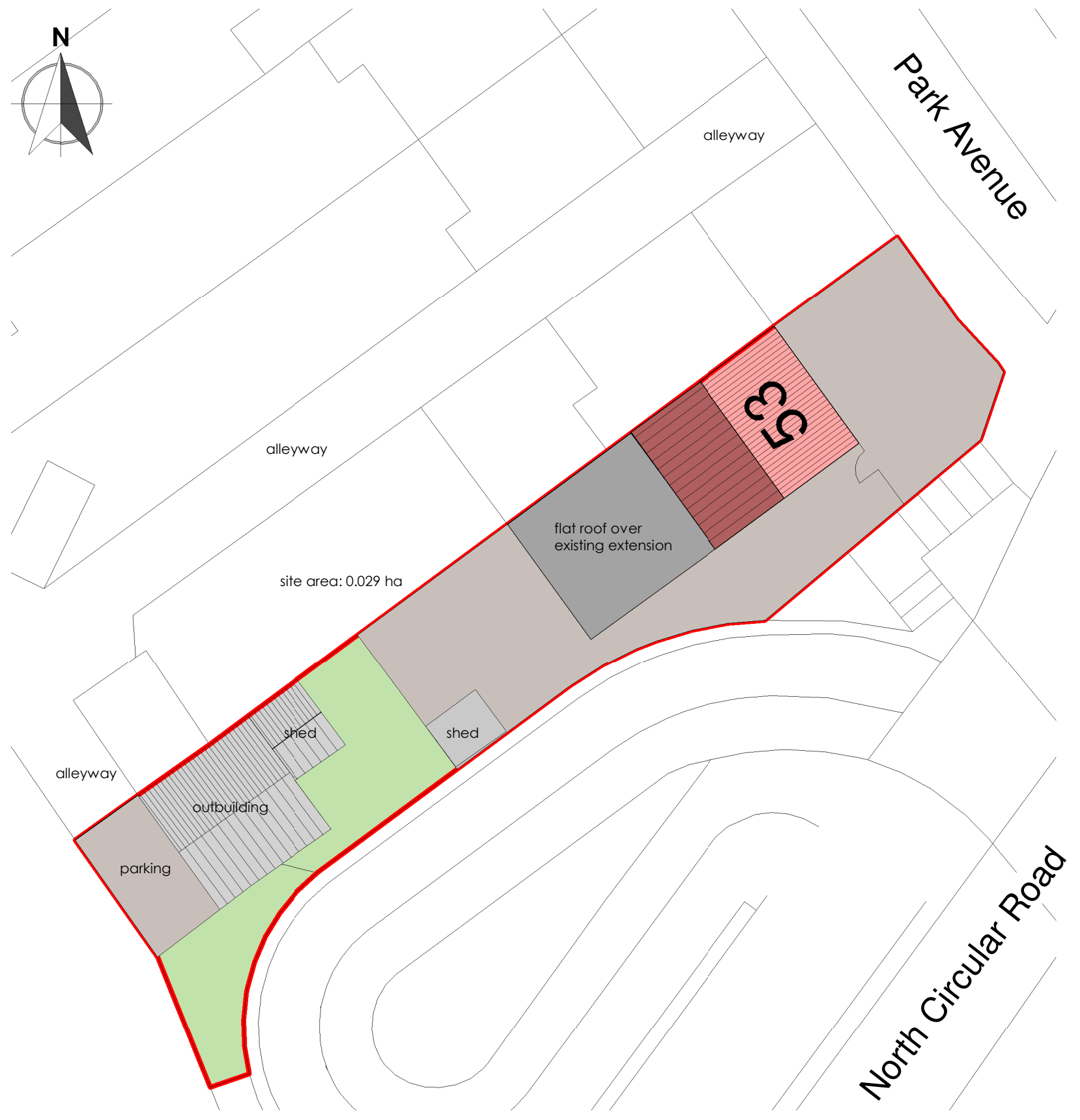
2 Existing Site Plan 2314-L-100 1 : 200