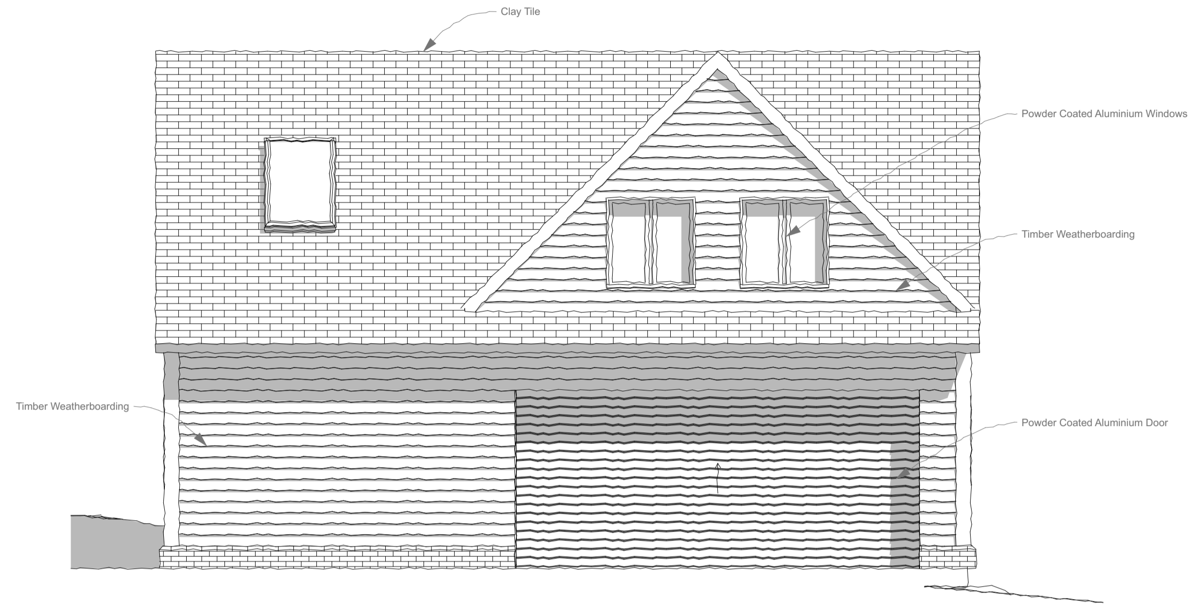
E-06 - Proposed East Elevation 1:50