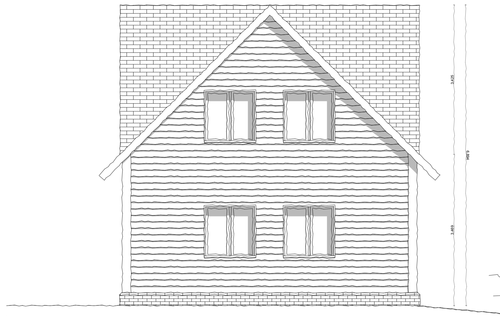
E-05 - Proposed North Elevation 1:50