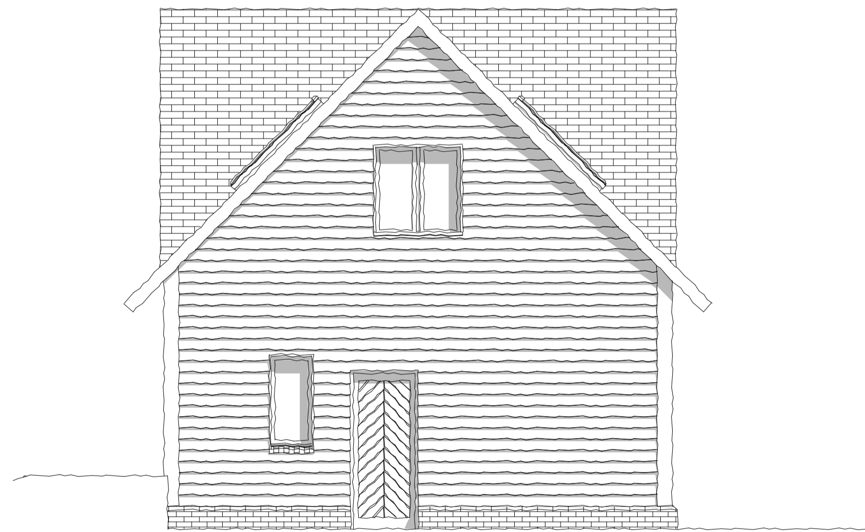
E-07 - Proposed South Elevation 1:50