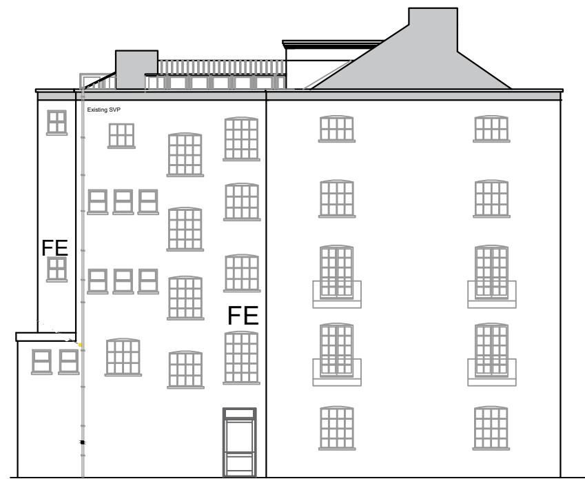
PROPOSED WEST ELEVATION (Extracts & Vents)