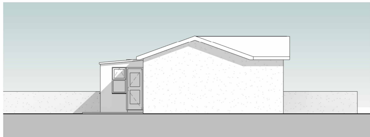
Existing West Elevation 1 : 100