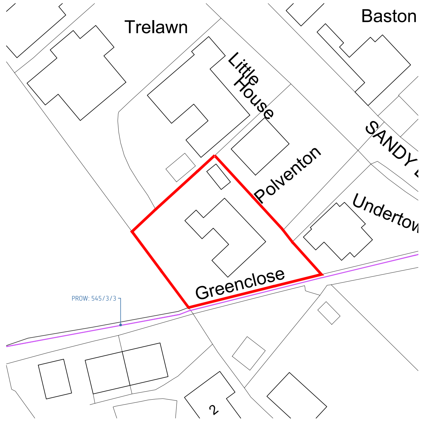
SITE BLOCK PLAN